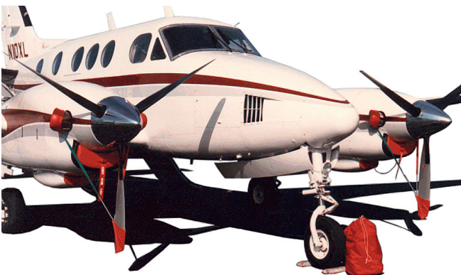
Pitot, Exhaust Covers, Engine Plugs & Prop Ties

Engine Inlet Plugs are custom fit for your Casa/IPTN CN-235 intakes, made with heavy-duty vinyl material, and stuffed with a single block of sculpted urethane foam. Each plug has a zipper that allows the foam to be removed and dried if necessary. Engine plugs have warning flags that are visible from the cockpit or 'remove before flight' streamers sewn onto the face of the plugs. Most plugs are imprinted with the aircraft registration number in black for an extra charge. Storage bag NOT included. Engine plugs may be inserted after flight when the engine is still warm. Engine Inlet Plugs are commonly referred to as Cowl Plugs, Intake Plugs, Cowl Blocks, Engine Blocks, and Engine Bungs.