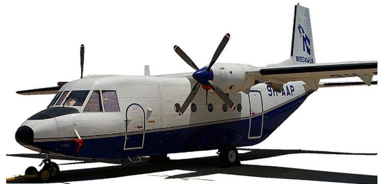
Casa 212 Engine Plugs