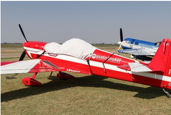
Mudry Cap 231 Canopy Cover