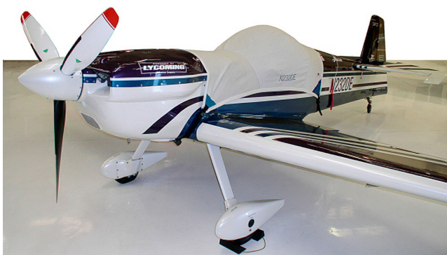
Canopy Cover for the Cap 232

Travel Covers are made with Silver Solution-Dyed Polyester fabric and only lined over the windshield to save weight. The material is lightweight and more compact for easy stowage in the aircraft. The polyester material is water resistant, but only intended for occasional use outside. We also have an ultra lightweight material available for fitted hangar dust covers. For daily outdoor use, the non-travel Sunbrella Cover is the best choice.