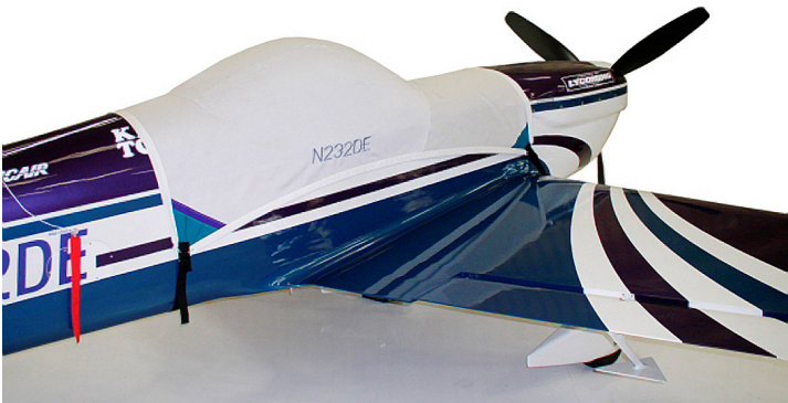
Cap 232 Canopy Cover