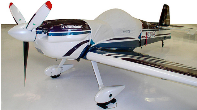
Canopy Cover for the Cap 232

The Mudry Cap 231 & 232 Canopy/Engine Cover is a one-piece cover (100% lined with microfiber) that is a combination of the Canopy Cover and Engine Cover. This cover will enclose the engine cowl and will extend aft to cover all of the windows. This cover type is made from Silver Acrylic Sunbrella canvas and is 100% lined with a soft and smooth microfiber. Bruce's Custom Covers developed this material combination especially for aircraft protection. The outer material is medium weight and treated for water resistance, UV resistance and anti-static buildup. The inner lining is a very soft and smooth microfiber to prevent scratching. The material is very reflective, and tests show that the cabin interior temperature can be reduced to near-ambient temperature on the hottest of days. It is water, ice and snow repellent, yet breathable to allow moisture to escape from between the cover and the aircraft surface.