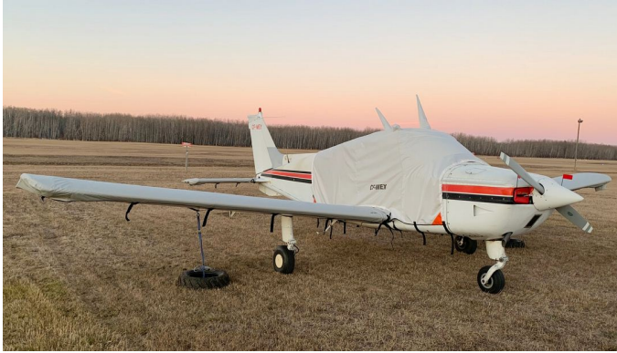
Sport B19 Engine Inlet Plugs

This cover type is made from Silver Acrylic Sunbrella canvas and is 100% lined with a soft and smooth microfiber. Bruce's Custom Covers developed this material combination especially for aircraft protection. The outer material is medium weight and treated for water resistance, UV resistance and anti-static buildup. The inner lining is a very soft and smooth microfiber to prevent scratching. The material is very reflective, and tests show that the cabin interior temperature can be reduced to near-ambient temperature on the hottest of days. It is water, ice and snow repellent, yet breathable to allow moisture to escape from between the cover and the aircraft surface.