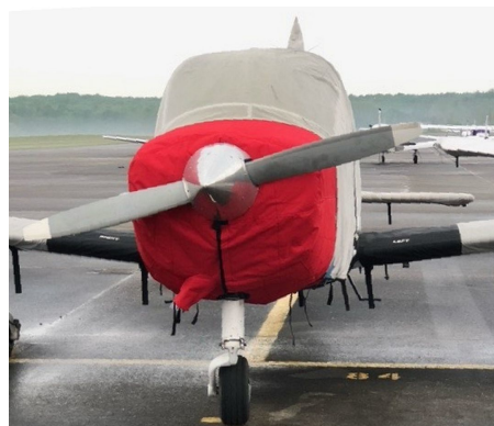
Beech Sierra Insulated Engine Cover