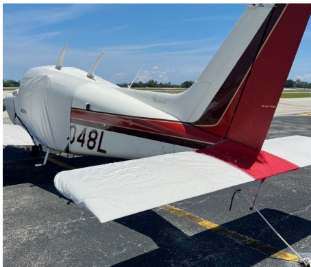
Beech C23 Sundowner Horizontal Stabilizer Covers, Tailcone Cover

WINTER USE MATERIAL - Made with Solution-Dyed Polyester fabric, this option is intended for seasonal use to aid in deicing, rain mitigation, or for occasional travel. The material is lighter and more compact, but more susceptible to UV damage and may have a shorter useful life if used continuously outside than the all-year use material.