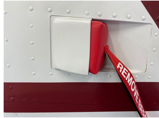
Beech Bonanza A36 Fresh Air Inlet/Exhaust Plug Set