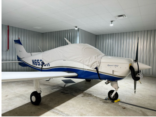
Beech Sport A19 Canopy Cover

This cover type is made from Silver Acrylic Sunbrella canvas and is 100% lined with a soft and smooth microfiber. Bruce's Custom Covers developed this material combination especially for aircraft protection. The outer material is medium weight and treated for water resistance, UV resistance and anti-static buildup. The inner lining is a very soft and smooth microfiber to prevent scratching. The material is very reflective, and tests show that the cabin interior temperature can be reduced to near-ambient temperature on the hottest of days. It is water, ice and snow repellent, yet breathable to allow moisture to escape from between the cover and the aircraft surface.