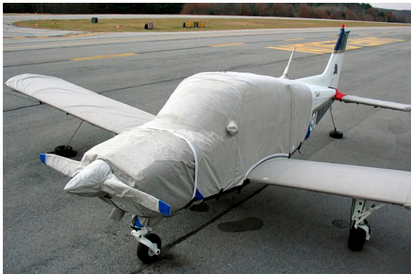
Beech Sierra Extended Canopy, Engine, Prop, Wings, Stab & Tailcone Covers

This cover type is made from Silver Acrylic Sunbrella canvas and is 100% lined with a soft and smooth microfiber. Bruce's Custom Covers developed this material combination especially for aircraft protection. The outer material is medium weight and treated for water resistance, UV resistance and anti-static buildup. The inner lining is a very soft and smooth microfiber to prevent scratching. The material is very reflective, and tests show that the cabin interior temperature can be reduced to near-ambient temperature on the hottest of days. It is water, ice and snow repellent, yet breathable to allow moisture to escape from between the cover and the aircraft surface.