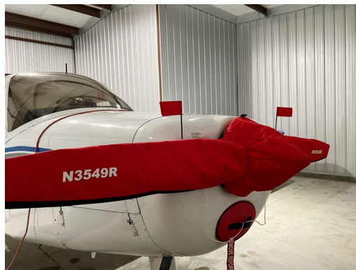
Beech A23 Musketeer Insulated Prop Cover, Engine Plugs