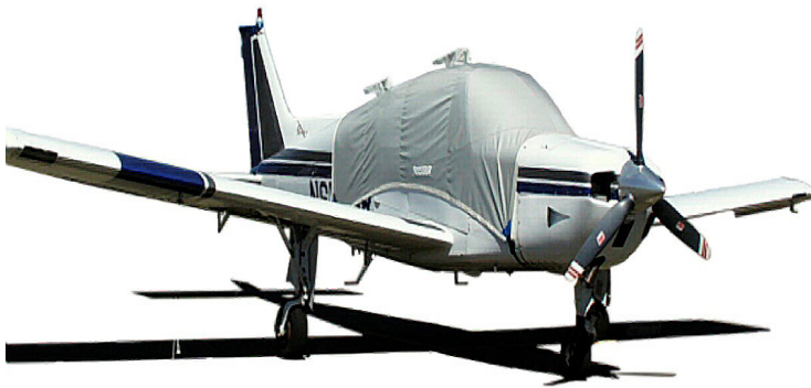
Beech Sport Canopy Cover

Travel Covers are made with Silver Solution-Dyed Polyester fabric and only lined over the windshield to save weight. The material is lightweight and more compact for easy stowage in the aircraft. The polyester material is water resistant, but only intended for occasional use outside. We also have an ultra lightweight material available for fitted hangar dust covers. For daily outdoor use, the non-travel Sunbrella Cover is the best choice.