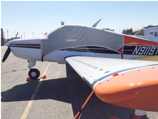
Beech Musketeer Canopy Cover

Travel Covers are made with Silver Solution-Dyed Polyester fabric and only lined over the windshield to save weight. The material is lightweight and more compact for easy stowage in the aircraft. The polyester material is water resistant, but only intended for occasional use outside. We also have an ultra lightweight material available for fitted hangar dust covers. For daily outdoor use, the non-travel Sunbrella Cover is the best choice.