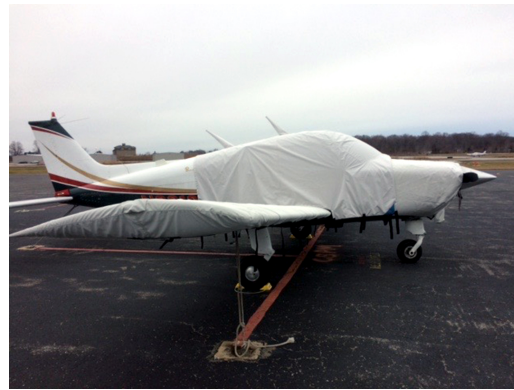
Beech Sundowner Extended Canopy Cover, Engine, and Wing Covers