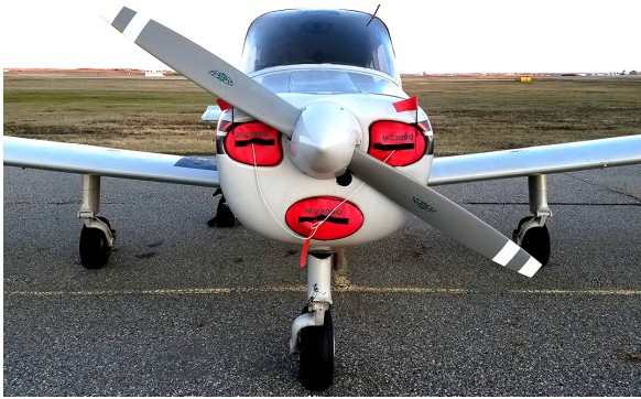
Beech Musketeer Engine Inlet Plugs

plugs have warning flags that are visible from the cockpit or 'remove before flight' streamers sewn onto the face of the plugs. Most plugs are imprinted with the aircraft registration number in black for an extra charge. Storage bag NOT included. Engine plugs may be inserted after flight when the engine is still warm. Engine Inlet Plugs are commonly referred to as Cowl Plugs, Intake Plugs, Cowl Blocks, Engine Blocks, and Engine Bungs.