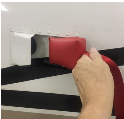
BEECH V35B Fresh Air Exhaust Plug

plugs have warning flags that are visible from the cockpit or 'remove before flight' streamers sewn onto the face of the plugs. Most plugs are imprinted with the aircraft registration number in black for an extra charge. Storage bag NOT included. Engine plugs may be inserted after flight when the engine is still warm. Engine Inlet Plugs are commonly referred to as Cowl Plugs, Intake Plugs, Cowl Blocks, Engine Blocks, and Engine Bungs.