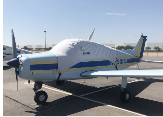
Beech Musketeer Canopy Cover