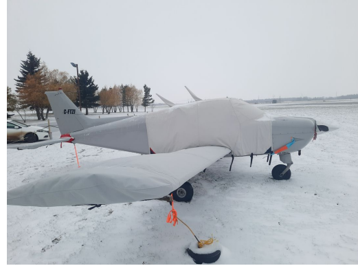
Beech C23 Sundowner Extended Canopy Cover, Wing Covers