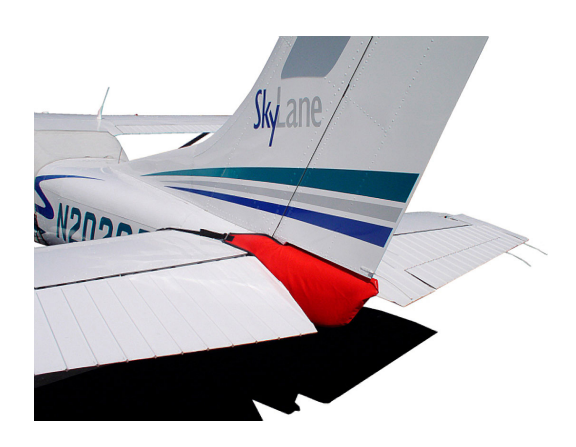
Cessna 182 Tailcone Cover