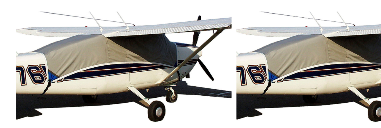
Cessna 206 Standard Canopy Cover