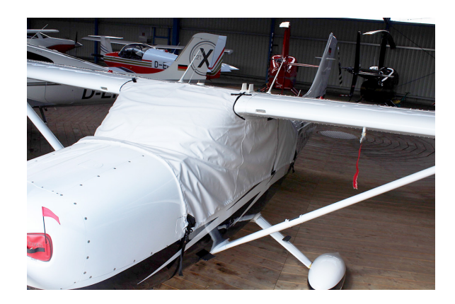
Cessna 206 Stationair Canopy Cover, Wrap-Around

This cover type is made from Silver Acrylic Sunbrella canvas and is 100% lined with a soft and smooth microfiber. Bruce's Custom Covers developed this material combination especially for aircraft protection. The outer material is medium weight and treated for water resistance, UV resistance and anti-static buildup. The inner lining is a very soft and smooth microfiber to prevent scratching. The material is very reflective, and tests show that the cabin interior temperature can be reduced to near-ambient temperature on the hottest of days. It is water, ice and snow repellent, yet breathable to allow moisture to escape from between the cover and the aircraft surface.