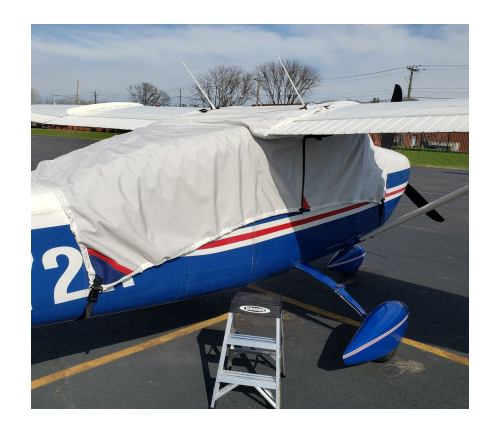
Cessna 205 Over The Top Style Canopy Cover