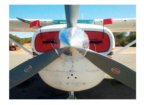
Cessna 207 Engine Inlet Plugs