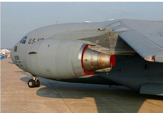
C-17 Bypass and Exhaust Plugs (illustration)

The Engine Inlet Plugs are custom fit for your McDonnell Douglas Globemaster C-17 intakes, made with heavy-duty vinyl material, and stuffed with a single block of sculpted urethane foam. Each plug has a zipper that allows the foam to be removed and dried if necessary. Engine plugs have 'remove before flight' streamers sewn onto the face of the plugs. Most plugs are imprinted with the aircraft registration number in black for an extra charge. Storage bag NOT included. Engine plugs may be inserted after flight when the engine is still warm. Engine Inlet Plugs are commonly referred to as Cowl Plugs, Intake Plugs, Cowl Blocks, Engine Blocks, and Engine Bungs.