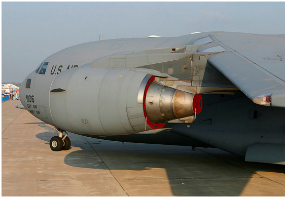
C-17 Bypass and Exhaust Plugs (illustration)