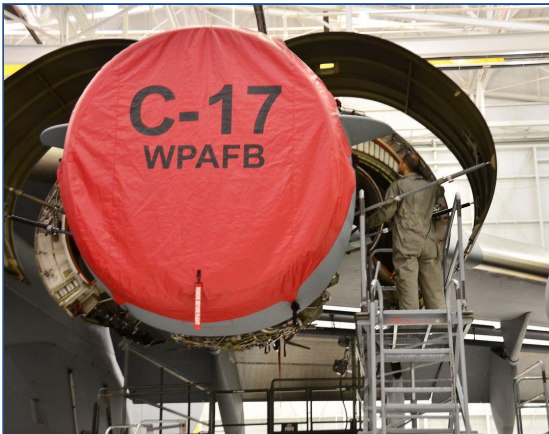
McDonnell Douglas C-17 Intake Cover