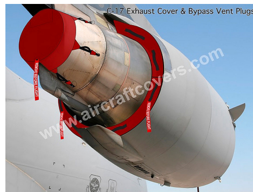
C-17 Globemaster Exhaust Cover and Bypass Vent Plugs, folding type