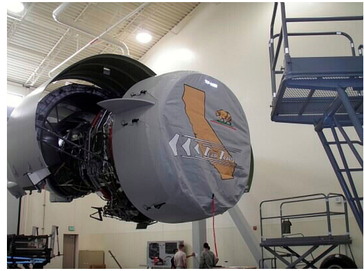
C-17 Engine Intake Cover with Custom Artwork