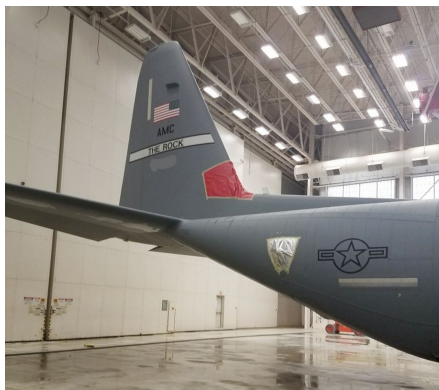
C-130 Vertical De-Ice Boot Cover