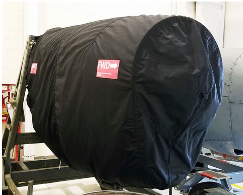
C-130 QEC / Maintenance Cover Set