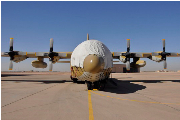
C-130 Cockpit Cover (Windshield/Flight Deck)