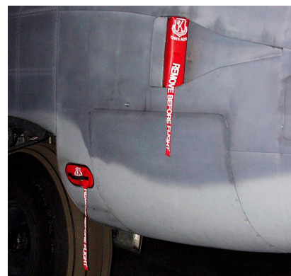
C-130 Heat Exchanger & Exhaust Plugs