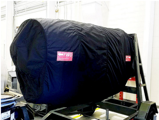
C-130 QEC / Maintenance Cover Set

This cover type is made from Silver Acrylic Sunbrella canvas and is 100% lined with a soft and smooth microfiber. Bruce's Custom Covers developed this material combination especially for aircraft protection. The outer material is medium weight and treated for water resistance, UV resistance and anti-static buildup. The inner lining is a very soft and smooth microfiber to prevent scratching. The material is very reflective, and tests show that the cabin interior temperature can be reduced to near-ambient temperature on the hottest of days. It is water, ice and snow repellent, yet breathable to allow moisture to escape from between the cover and the aircraft surface.