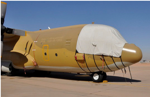
C-130 Cockpit Cover (Windshield/Flight Deck)

escape from between the cover and the aircraft surface.