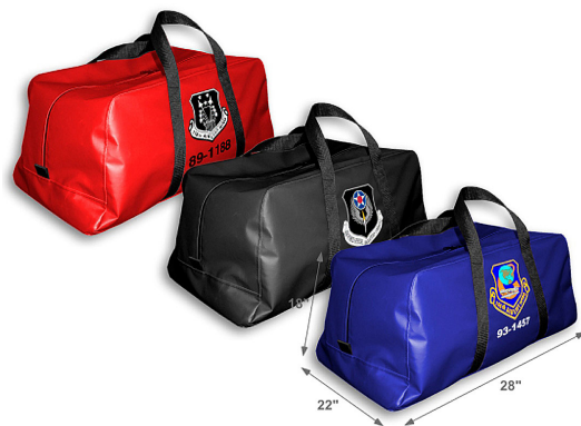
C-130 Plug Set Storage Bag