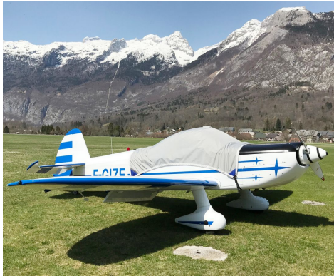
Mudry Cap 10 Canopy Cover

water resistance, UV resistance and anti-static buildup. The inner lining is a very soft and smooth microfiber to prevent scratching. The material is very reflective, and tests show that the cabin interior temperature can be reduced to near-ambient temperature on the hottest of days. It is water, ice and snow repellent, yet breathable to allow moisture to escape from between the cover and the aircraft surface.