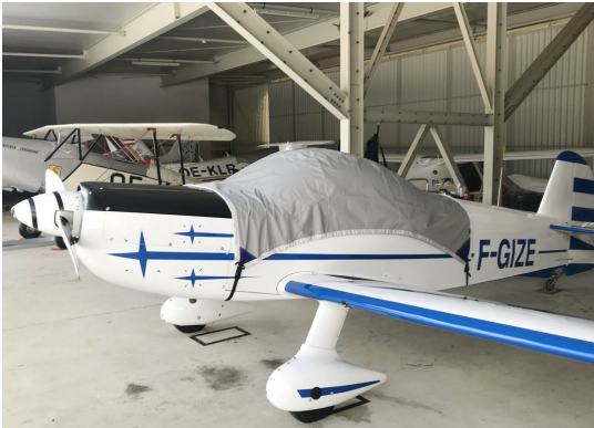
Mudry Cap 10 Travel Cover, Light Weight Travel Canopy Cover

Travel Covers are made with Silver Solution-Dyed Polyester fabric and only lined over the windshield to save weight. The material is lightweight and more compact for easy stowage in the aircraft. The polyester material is water resistant, but only intended for occasional use outside. We also have an ultra lightweight material available for fitted hangar dust covers. For daily outdoor use, the non-travel Sunbrella Cover is the best choice.