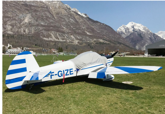
Mudry Cap 10 Canopy Cover