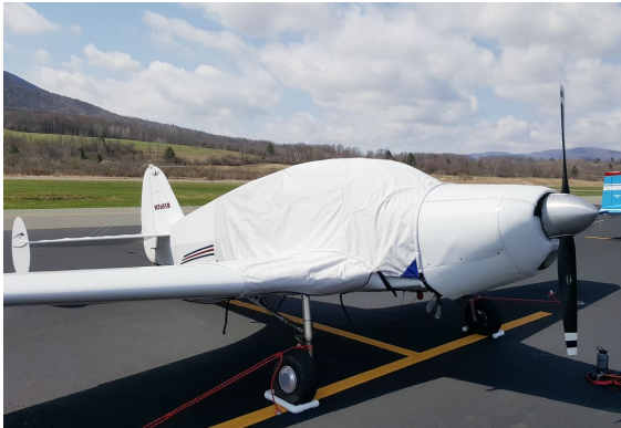
Bellanca Cruisemaster Extended Canopy Cover with 36" Wing Extensions.