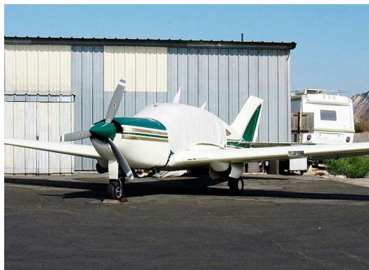
Bellanca Viking Canopy Cover

Travel Covers are made with Silver Solution-Dyed Polyester fabric and only lined over the windshield to save weight. The material is lightweight and more compact for easy stowage in the aircraft. The polyester material is water resistant, but only intended for occasional use outside. We also have an ultra lightweight material available for fitted hangar dust covers. For daily outdoor use, the non-travel Sunbrella Cover is the best choice.