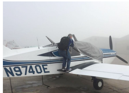
Bellanca Viking Travel Cover