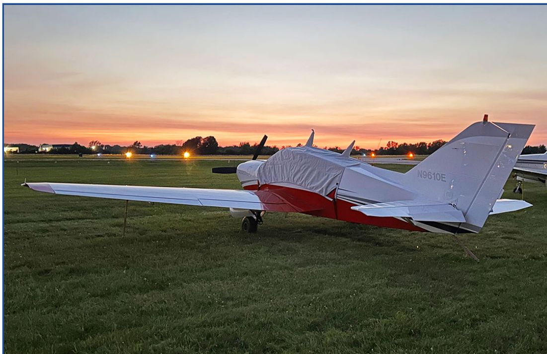
Bellanca 17-30A Canopy Cover, Belly Strap Type