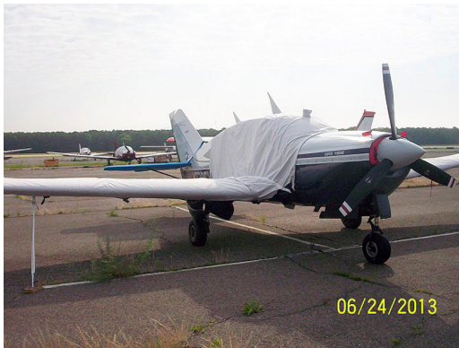
Bellanca Viking Canopy Cover with Wing Root Covers, Wing Covers, Engine Plugs

WINTER USE MATERIAL - Made with Solution-Dyed Polyester fabric, this option is intended for seasonal use to aid in deicing, rain mitigation, or for occasional travel. The material is lighter and more compact, but more susceptible to UV damage and may have a shorter useful life if used continuously outside than the all-year use material.