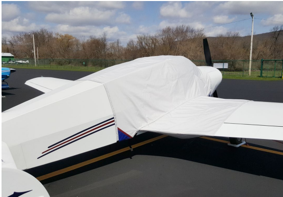
Bellanca Cruisemaster Extended Canopy Cover with 36" Wing Extensions.

This cover type is made from Silver Acrylic Sunbrella canvas and is 100% lined with a soft and smooth microfiber. Bruce's Custom Covers developed this material combination especially for aircraft protection. The outer material is medium weight and treated for water resistance, UV resistance and anti-static buildup. The inner lining is a very soft and smooth microfiber to prevent scratching. The material is very reflective, and tests show that the cabin interior temperature can be reduced to near-ambient temperature on the hottest of days. It is water, ice and snow repellent, yet breathable to allow moisture to escape from between the cover and the aircraft surface.