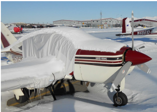
Bellanca Viking Extended Canopy Cover with 36" Wing Extensions, Wing Covers