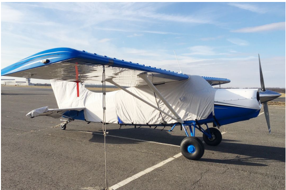
Maule M-5-235C Extended Canopy Cover, Empennage Cover Maule M-5-235C Extended Canopy Cover, Empennage Cover