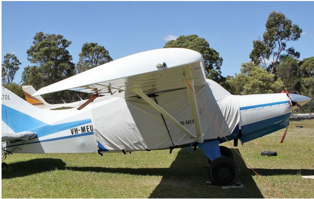
Maule (All Models) Extended Canopy Cover (Over-Top Style), Specify Model & Year