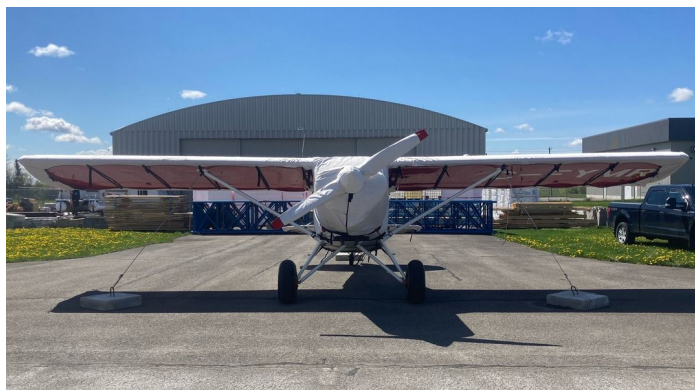
Bearhawk 4-Place Complete Cover Set