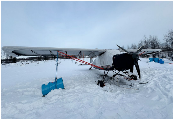
Bushmaster Wing, Canopy & Insulated Engine Covers