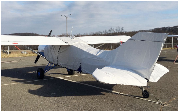
Maule M-5-235C Extended Canopy Cover, Empennage Cover

This cover type is made from Silver Acrylic Sunbrella canvas and is 100% lined with a soft and smooth microfiber. Bruce's Custom Covers developed this material combination especially for aircraft protection. The outer material is medium weight and treated for water resistance, UV resistance and anti-static buildup. The inner lining is a very soft and smooth microfiber to prevent scratching. The material is very reflective, and tests show that the cabin interior temperature can be reduced to near-ambient temperature on the hottest of days. It is water, ice and snow repellent, yet breathable to allow moisture to escape from between the cover and the aircraft surface.