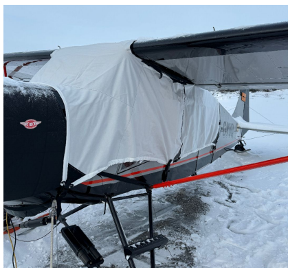
Bushmaster Canopy & Insulated Engine Covers

WINTER USE MATERIAL - Made with Solution-Dyed Polyester fabric, this option is intended for seasonal use to aid in deicing, rain mitigation, or for occasional travel. The material is lighter and more compact, but more susceptible to UV damage and may have a shorter useful life if used continuously outside than the all-year use material.