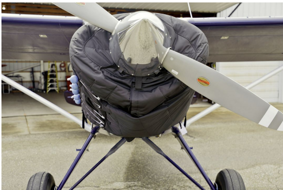
Bearhawk Insulated Engine Cover

This cover type is made from Silver Acrylic Sunbrella canvas and is 100% lined with a soft and smooth microfiber. Bruce's Custom Covers developed this material combination especially for aircraft protection. The outer material is medium weight and treated for water resistance, UV resistance and anti-static buildup. The inner lining is a very soft and smooth microfiber to prevent scratching. The material is very reflective, and tests show that the cabin interior temperature can be reduced to near-ambient temperature on the hottest of days. It is water, ice and snow repellent, yet breathable to allow moisture to escape from between the cover and the aircraft surface.