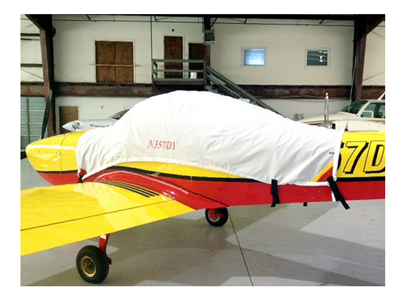
Ikarus Breezer Canopy Cover

This cover type is made from Silver Acrylic Sunbrella canvas and is 100% lined with a soft and smooth microfiber. Bruce's Custom Covers developed this material combination especially for aircraft protection. The outer material is medium weight and treated for water resistance, UV resistance and anti-static buildup. The inner lining is a very soft and smooth microfiber to prevent scratching. The material is very reflective, and tests show that the cabin interior temperature can be reduced to near-ambient temperature on the hottest of days. It is water, ice and snow repellent, yet breathable to allow moisture to escape from between the cover and the aircraft surface.