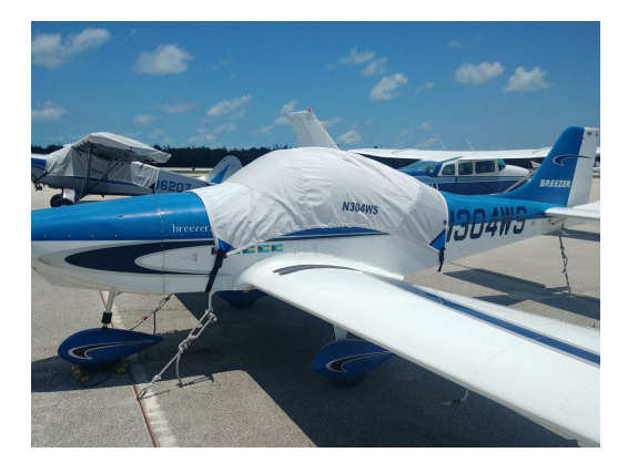
Ikarus Breezer Canopy Cover