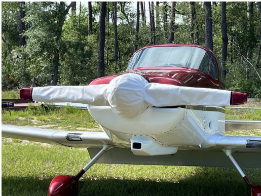
Mustang 2 Prop/Spinner Cover