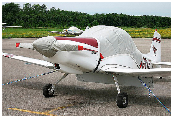
Bushby Mustang Canopy cover and Propellor/Spinner cover