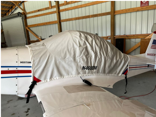
Bushby Mustang I & II Canopy Cover (Bubble Canopy), Belly Strap Type