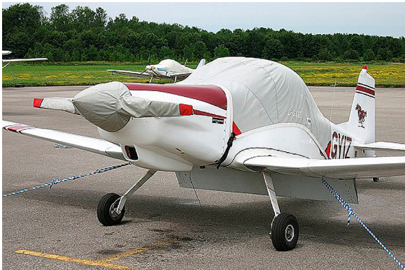
Bushby Mustang Canopy cover and Propellor/Spinner cover

This cover type is made from Silver Acrylic Sunbrella canvas and is 100% lined with a soft and smooth microfiber. Bruce's Custom Covers developed this material combination especially for aircraft protection. The outer material is medium weight and treated for water resistance, UV resistance and anti-static buildup. The inner lining is a very soft and smooth microfiber to prevent scratching. The material is very reflective, and tests show that the cabin interior temperature can be reduced to near-ambient temperature on the hottest of days. It is water, ice and snow repellent, yet breathable to allow moisture to escape from between the cover and the aircraft surface.