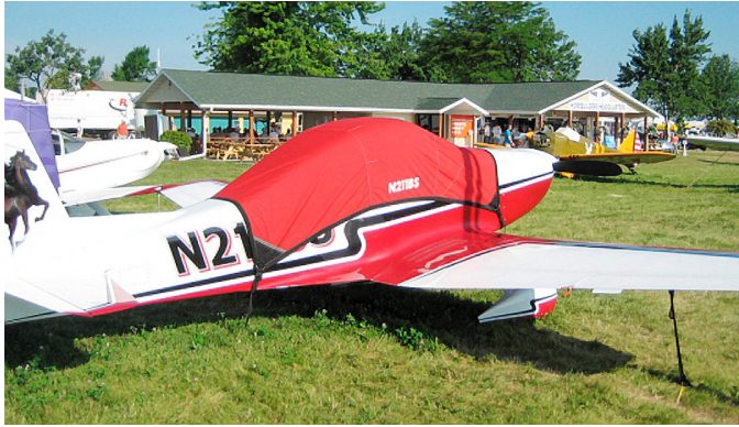
Bushby Mustang Canopy Cover

Travel Covers are made with Silver Solution-Dyed Polyester fabric and only lined over the windshield to save weight. The material is lightweight and more compact for easy stowage in the aircraft. The polyester material is water resistant, but only intended for occasional use outside. We also have an ultra lightweight material available for fitted hangar dust covers. For daily outdoor use, the non-travel Sunbrella Cover is the best choice.