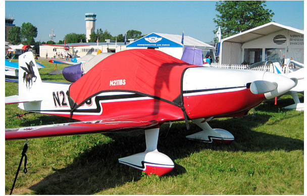
Bushby Mustang Canopy Cover