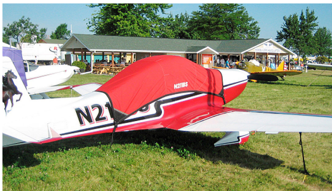
Bushby Mustang Canopy Cover

Travel Covers are made with Silver Solution-Dyed Polyester fabric and only lined over the windshield to save weight. The material is lightweight and more compact for easy stowage in the aircraft. The polyester material is water resistant, but only intended for occasional use outside. We also have an ultra lightweight material available for fitted hangar dust covers. For daily outdoor use, the non-travel Sunbrella Cover is the best choice.