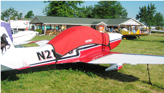
Bushby Mustang Canopy Cover