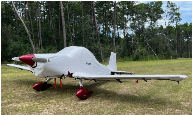
Bushby Mustang Complete Fuselage Cover with Detachable Wing Covers

This cover type is made from Silver Acrylic Sunbrella canvas and is 100% lined with a soft and smooth microfiber. Bruce's Custom Covers developed this material combination especially for aircraft protection. The outer material is medium weight and treated for water resistance, UV resistance and anti-static buildup. The inner lining is a very soft and smooth microfiber to prevent scratching. The material is very reflective, and tests show that the cabin interior temperature can be reduced to near-ambient temperature on the hottest of days. It is water, ice and snow repellent, yet breathable to allow moisture to escape from between the cover and the aircraft surface.