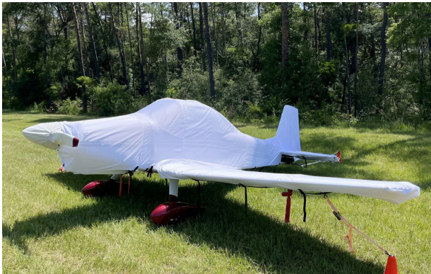
Thorp T-18 & Bushby Mustang Complete Cover, test fit cover

This cover type is made from Silver Acrylic Sunbrella canvas and is 100% lined with a soft and smooth microfiber. Bruce's Custom Covers developed this material combination especially for aircraft protection. The outer material is medium weight and treated for water resistance, UV resistance and anti-static buildup. The inner lining is a very soft and smooth microfiber to prevent scratching. The material is very reflective, and tests show that the cabin interior temperature can be reduced to near-ambient temperature on the hottest of days. It is water, ice and snow repellent, yet breathable to allow moisture to escape from between the cover and the aircraft surface.