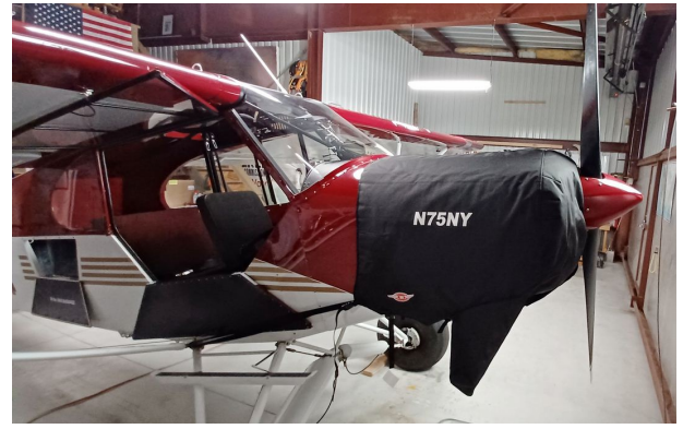
Piper PA-18 Super Cub Insulated Engine Cover