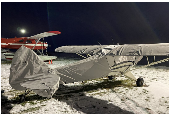
PA-18 Super Cub Winter Cover Set

This cover type is made from Silver Acrylic Sunbrella canvas and is 100% lined with a soft and smooth microfiber. Bruce's Custom Covers developed this material combination especially for aircraft protection. The outer material is medium weight and treated for water resistance, UV resistance and anti-static buildup. The inner lining is a very soft and smooth microfiber to prevent scratching. The material is very reflective, and tests show that the cabin interior temperature can be reduced to near-ambient temperature on the hottest of days. It is water, ice and snow repellent, yet breathable to allow moisture to escape from between the cover and the aircraft surface.