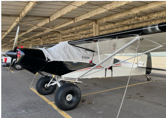
Piper PA-18 Super Cub Canopy Cover, Over Top Type

Engine Inlet Plugs are custom fit for your Badlands Traveler intakes, made with heavy-duty vinyl material, and stuffed with a single block of sculpted urethane foam. Each plug has a zipper that allows the foam to be removed and dried if necessary. Engine plugs have warning flags that are visible from the cockpit or 'remove before flight' streamers sewn onto the face of the plugs. Most plugs are imprinted with the aircraft registration number in black for an extra charge. Storage bag NOT included. Engine plugs may be inserted after flight when the engine is still warm. Engine Inlet Plugs are commonly referred to as Cowl Plugs, Intake Plugs, Cowl Blocks, Engine Blocks, and Engine Bungs.