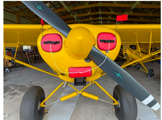
Piper PA-18-150 Engine Inlet Plugs (set of 3)