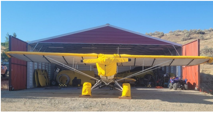
Piper PA-18 All Weather Cover Set