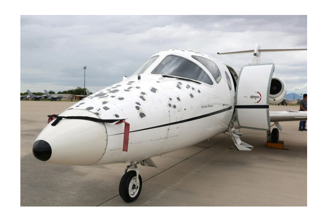
Jayhawk Hail Damage