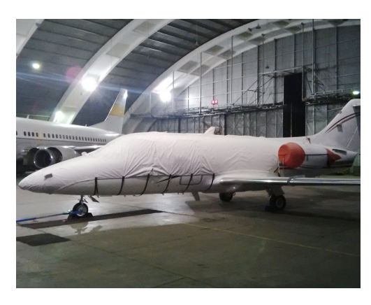
Beechjet 400 Cabin/Nose Cover, Engine Covers