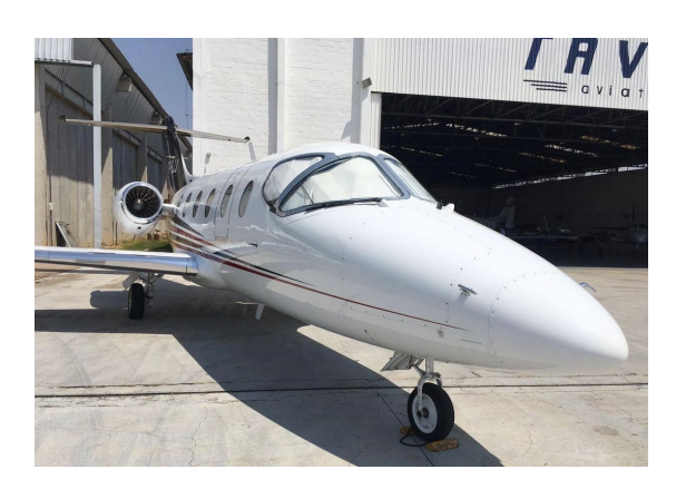
Beechjet Cockpit Heatshields