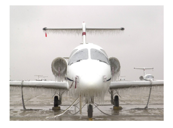
Beechjet 400 Engine Covers