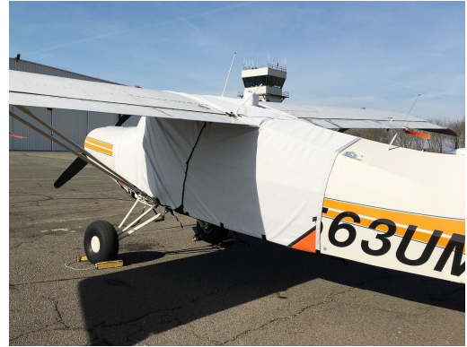
Maule M-5-235C Extended Canopy Cover