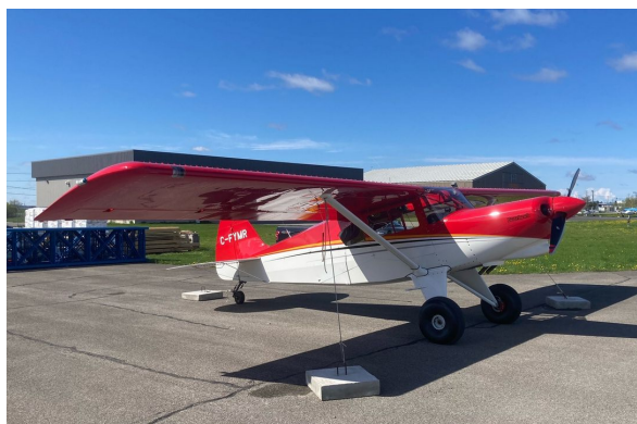
Bearhawk 4-Place Complete Cover Set, BEFORE

This cover type is made from Silver Acrylic Sunbrella canvas and is 100% lined with a soft and smooth microfiber. Bruce's Custom Covers developed this material combination especially for aircraft protection. The outer material is medium weight and treated for water resistance, UV resistance and anti-static buildup. The inner lining is a very soft and smooth microfiber to prevent scratching. The material is very reflective, and tests show that the cabin interior temperature can be reduced to near-ambient temperature on the hottest of days. It is water, ice and snow repellent, yet breathable to allow moisture to escape from between the cover and the aircraft surface.