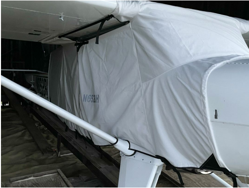
Avipro Bearhawk Extended Over The Top Canopy Cover

This cover type is made from Silver Acrylic Sunbrella canvas and is 100% lined with a soft and smooth microfiber. Bruce's Custom Covers developed this material combination especially for aircraft protection. The outer material is medium weight and treated for water resistance, UV resistance and anti-static buildup. The inner lining is a very soft and smooth microfiber to prevent scratching. The material is very reflective, and tests show that the cabin interior temperature can be reduced to near-ambient temperature on the hottest of days. It is water, ice and snow repellent, yet breathable to allow moisture to escape from between the cover and the aircraft surface.