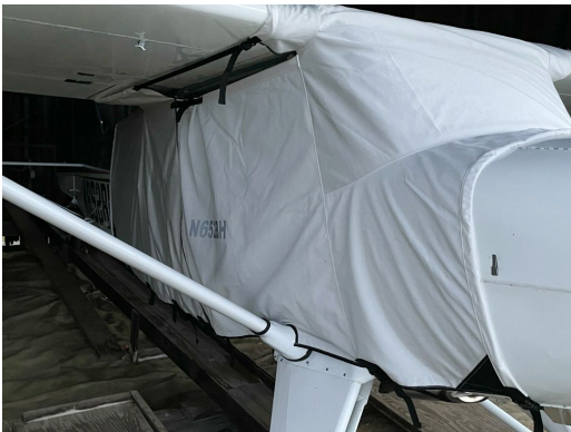
Avipro Bearhawk Extended Over The Top Canopy Cover

This cover type is made from Silver Acrylic Sunbrella canvas and is 100% lined with a soft and smooth microfiber. Bruce's Custom Covers developed this material combination especially for aircraft protection. The outer material is medium weight and treated for water resistance, UV resistance and anti-static buildup. The inner lining is a very soft and smooth microfiber to prevent scratching. The material is very reflective, and tests show that the cabin interior temperature can be reduced to near-ambient temperature on the hottest of days. It is water, ice and snow repellent, yet breathable to allow moisture to escape from between the cover and the aircraft surface.