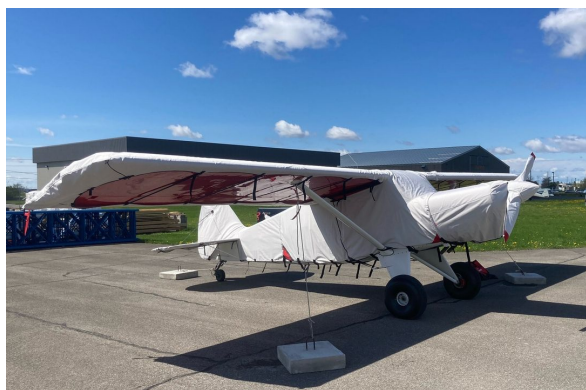
Bearhawk 4-Place Complete Cover Set, AFTER

This cover type is made from Silver Acrylic Sunbrella canvas and is 100% lined with a soft and smooth microfiber. Bruce's Custom Covers developed this material combination especially for aircraft protection. The outer material is medium weight and treated for water resistance, UV resistance and anti-static buildup. The inner lining is a very soft and smooth microfiber to prevent scratching. The material is very reflective, and tests show that the cabin interior temperature can be reduced to near-ambient temperature on the hottest of days. It is water, ice and snow repellent, yet breathable to allow moisture to escape from between the cover and the aircraft surface.