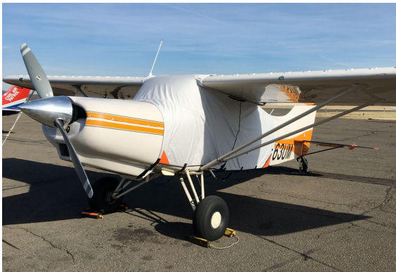
Maule M-5-235C Extended Canopy Cover