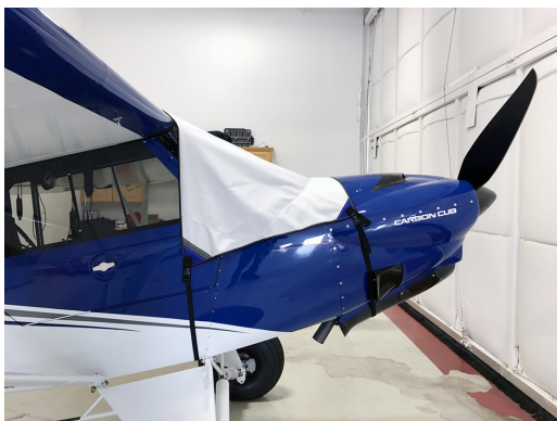
Cub Crafters CC-11 Windshield Cover

This cover type is made from Silver Acrylic Sunbrella canvas and is 100% lined with a soft and smooth microfiber. Bruce's Custom Covers developed this material combination especially for aircraft protection. The outer material is medium weight and treated for water resistance, UV resistance and anti-static buildup. The inner lining is a very soft and smooth microfiber to prevent scratching. The material is very reflective, and tests show that the cabin interior temperature can be reduced to near-ambient temperature on the hottest of days. It is water, ice and snow repellent, yet breathable to allow moisture to escape from between the cover and the aircraft surface.