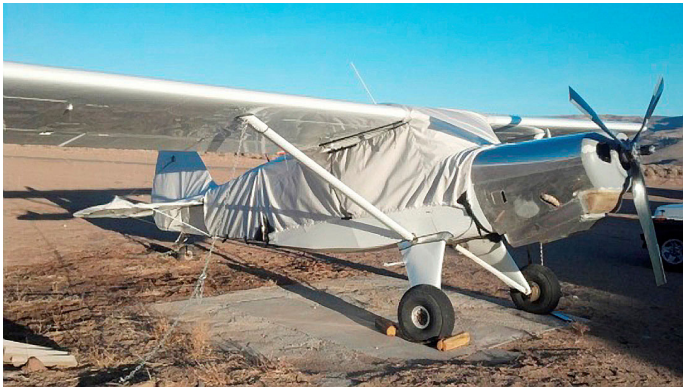
Bearhawk Canopy & Empennage Cover