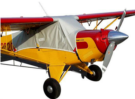
Aviat Husky Canopy Cover &amp; Engine Plugs