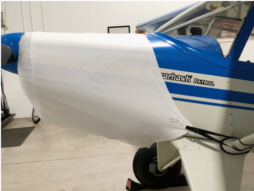
Bearhawk Patrol Engine Cover, test fit cover

This cover type is made from Silver Acrylic Sunbrella canvas and is 100% lined with a soft and smooth microfiber. Bruce's Custom Covers developed this material combination especially for aircraft protection. The outer material is medium weight and treated for water resistance, UV resistance and anti-static buildup. The inner lining is a very soft and smooth microfiber to prevent scratching. The material is very reflective, and tests show that the cabin interior temperature can be reduced to near-ambient temperature on the hottest of days. It is water, ice and snow repellent, yet breathable to allow moisture to escape from between the cover and the aircraft surface.