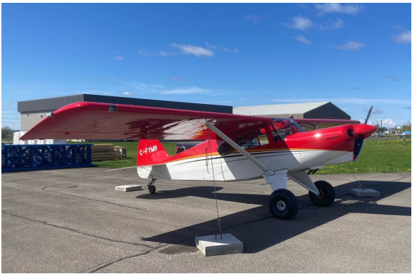
Bearhawk 4-Place Complete Cover Set, BEFORE

WINTER USE MATERIAL - Made with Solution-Dyed Polyester fabric, this option is intended for seasonal use to aid in deicing, rain mitigation, or for occasional travel. The material is lighter and more compact, but more susceptible to UV damage and may have a shorter useful life if used continuously outside than the all-year use material.