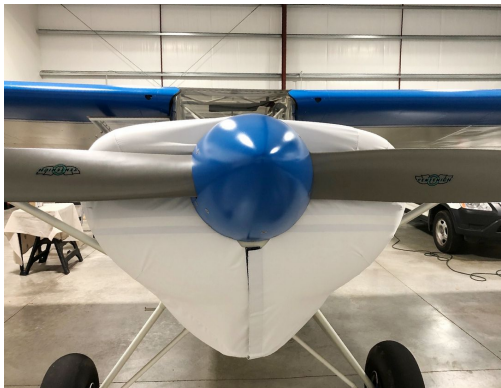
Bearhawk Patrol Engine Cover, test fit cover

This cover type is made from Silver Acrylic Sunbrella canvas and is 100% lined with a soft and smooth microfiber. Bruce's Custom Covers developed this material combination especially for aircraft protection. The outer material is medium weight and treated for water resistance, UV resistance and anti-static buildup. The inner lining is a very soft and smooth microfiber to prevent scratching. The material is very reflective, and tests show that the cabin interior temperature can be reduced to near-ambient temperature on the hottest of days. It is water, ice and snow repellent, yet breathable to allow moisture to escape from between the cover and the aircraft surface.