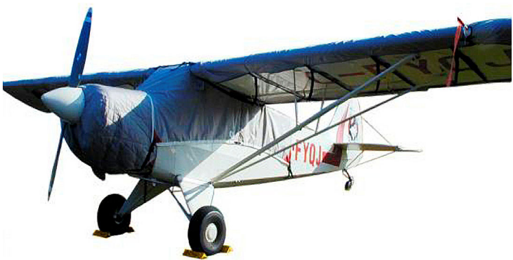
Aviat Husky Insulated Engine Cover, Canopy & Wing Covers