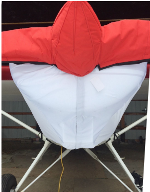
Bearhawk Engine Cover (test fit), Insulated Prop Cover