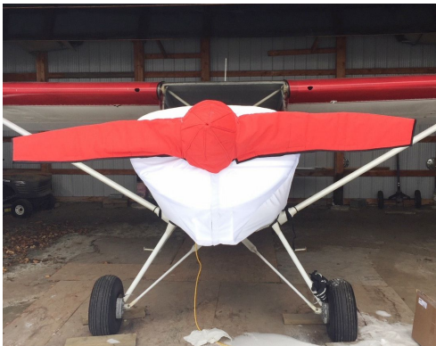
Bearhawk Engine Cover (test fit), Insulated Prop Cover