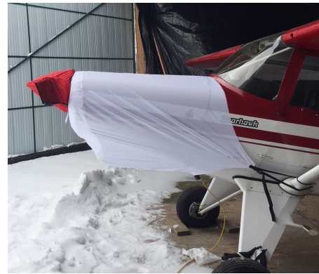
Bearhawk Engine Cover (test fit), Insulated Prop Cover