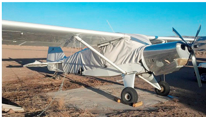
Bearhawk Canopy & Empennage Cover

This cover type is made from Silver Acrylic Sunbrella canvas and is 100% lined with a soft and smooth microfiber. Bruce's Custom Covers developed this material combination especially for aircraft protection. The outer material is medium weight and treated for water resistance, UV resistance and anti-static buildup. The inner lining is a very soft and smooth microfiber to prevent scratching. The material is very reflective, and tests show that the cabin interior temperature can be reduced to near-ambient temperature on the hottest of days. It is water, ice and snow repellent, yet breathable to allow moisture to escape from between the cover and the aircraft surface.