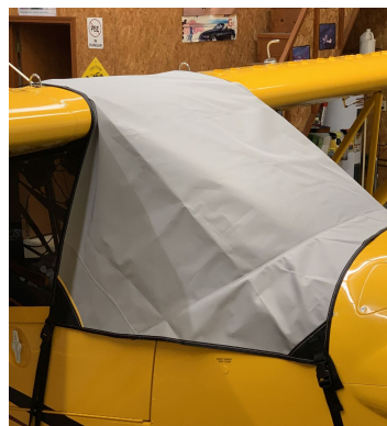
Cub Crafters Carbon Cub FX3 Windshield/Skylight Cover, travel weight