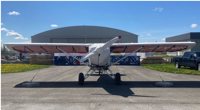
Bearhawk 4-Place Complete Cover Set

This cover type is made from Silver Acrylic Sunbrella canvas and is 100% lined with a soft and smooth microfiber. Bruce's Custom Covers developed this material combination especially for aircraft protection. The outer material is medium weight and treated for water resistance, UV resistance and anti-static buildup. The inner lining is a very soft and smooth microfiber to prevent scratching. The material is very reflective, and tests show that the cabin interior temperature can be reduced to near-ambient temperature on the hottest of days. It is water, ice and snow repellent, yet breathable to allow moisture to escape from between the cover and the aircraft surface.