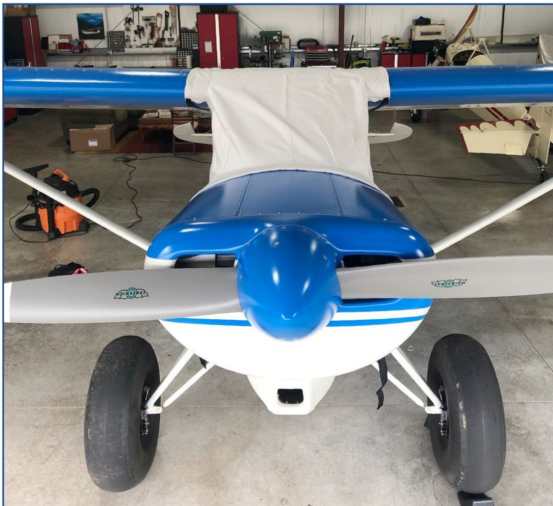
Bearhawk 2-Place Model Canopy Cover