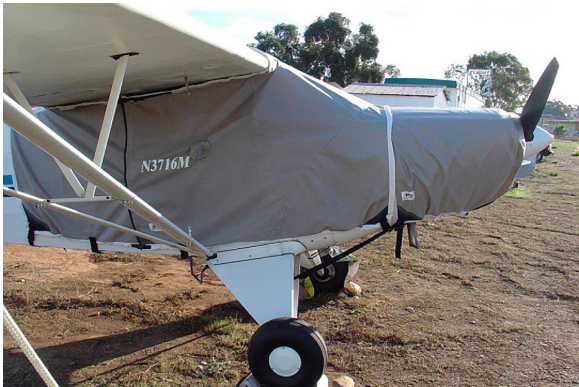
Piper PA-12 Super Cruiser Extended Over-the-Top Canopy Cover & Engine Cover

This cover type is made from Silver Acrylic Sunbrella canvas and is 100% lined with a soft and smooth microfiber. Bruce's Custom Covers developed this material combination especially for aircraft protection. The outer material is medium weight and treated for water resistance, UV resistance and anti-static buildup. The inner lining is a very soft and smooth microfiber to prevent scratching. The material is very reflective, and tests show that the cabin interior temperature can be reduced to near-ambient temperature on the hottest of days. It is water, ice and snow repellent, yet breathable to allow moisture to escape from between the cover and the aircraft surface.