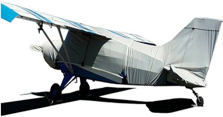
Maule Empennage, Engine & Prop Covers