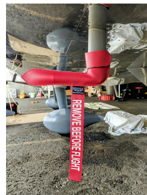
Van's RV-14 Pitot Cover