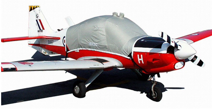
Scottish Aviation Bulldog Canopy Cover