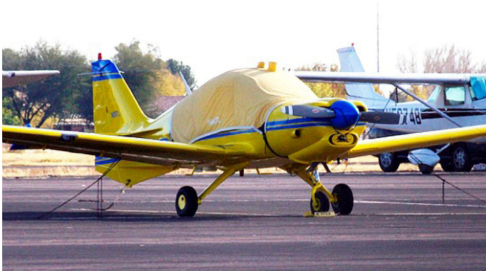
Beagle Pup Canopy Cover

This cover type is made from Silver Acrylic Sunbrella canvas and is 100% lined with a soft and smooth microfiber. Bruce's Custom Covers developed this material combination especially for aircraft protection. The outer material is medium weight and treated for water resistance, UV resistance and anti-static buildup. The inner lining is a very soft and smooth microfiber to prevent scratching. The material is very reflective, and tests show that the cabin interior temperature can be reduced to near-ambient temperature on the hottest of days. It is water, ice and snow repellent, yet breathable to allow moisture to escape from between the cover and the aircraft surface.