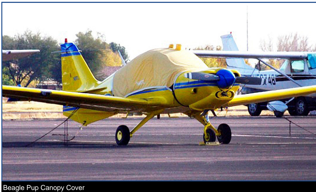
Beagle Pup Canopy Cover