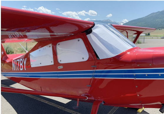
Bellanca Decathlon 8KCAB Heatshield Set with white side out

foam with a silver mylar finish. The semi-rigid design is stiff enough to stand along the inside of the windshield using sun visors or window framing. It folds up flat and easily stores in the included storage sleeve. Some designs may require velcro and suction cups or split right and left sides. A Heatshield is an excellent short-term remedy for cockpit overheating. An external fabric cover is far more effective and practical for long-term protection.