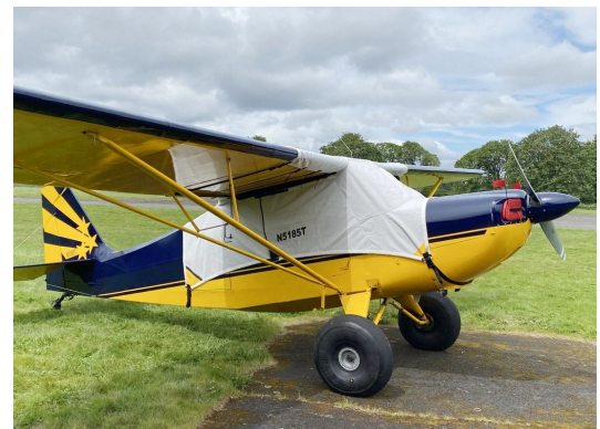
American Champion Citabria canopy cover over the top style, extends to cover gas caps, Engine Plugs