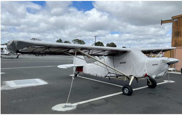
Bellanca Decathlon Full Cover Set