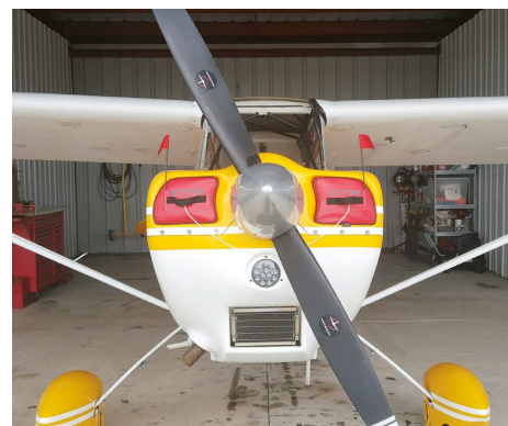
Bellanca Citabria, Scout, Explorer Engine Inlet Plugs