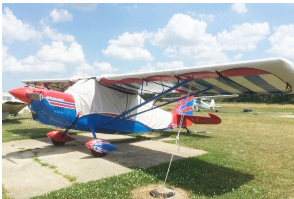
Bellanca Decathlon Canopy Cover (Over-Top, Extended to tail), Wing Covers, Engine Plugs

Engine Inlet Plugs are custom fit for your Bellanca (American Champion) Decathlon intakes, made with heavy-duty vinyl material, and stuffed with a single block of sculpted urethane foam. Each plug has a zipper that allows the foam to be removed and dried if necessary. Engine plugs have warning flags that are visible from the cockpit or 'remove before flight' streamers sewn onto the face of the plugs. Most plugs are imprinted with the aircraft registration number in black for an extra charge. Storage bag NOT included. Engine plugs may be inserted after flight when the engine is still warm. Engine Inlet Plugs are commonly referred to as Cowl Plugs, Intake Plugs, Cowl Blocks, Engine Blocks, and Engine Bungs.