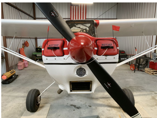
BELLANCA 7ECA Engine Inlet Plugs

Engine Inlet Plugs are custom fit for your Bellanca (American Champion) Decathlon intakes, made with heavy-duty vinyl material, and stuffed with a single block of sculpted urethane foam. Each plug has a zipper that allows the foam to be removed and dried if necessary. Engine plugs have warning flags that are visible from the cockpit or 'remove before flight' streamers sewn onto the face of the plugs. Most plugs are imprinted with the aircraft registration number in black for an extra charge. Storage bag NOT included. Engine plugs may be inserted after flight when the engine is still warm. Engine Inlet Plugs are commonly referred to as Cowl Plugs, Intake Plugs, Cowl Blocks, Engine Blocks, and Engine Bungs.