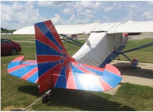
Bellanca Decathlon Canopy Cover (Over-Top, Extended to tail), Wing Covers.