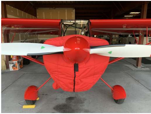
American Champion 8KCAB Insulated Engine Cover