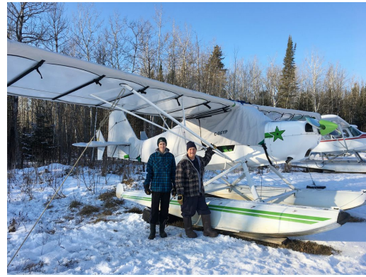
Bellanca Citabria Canopy Cover (extends to tail), Wing Covers, Empennage Covers