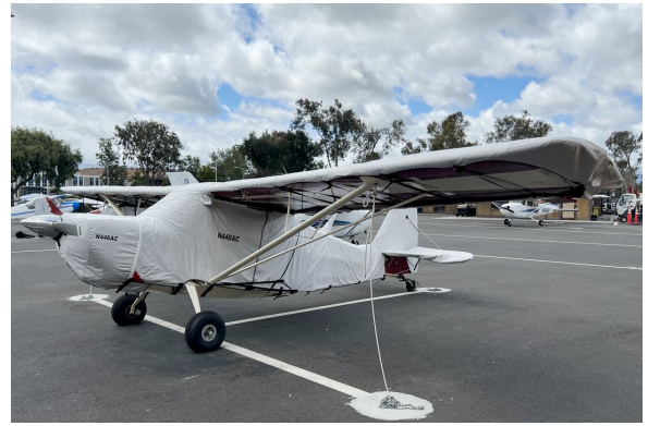
Bellanca Decathlon Full Cover Set