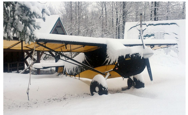
Bellanca 7GCBC Winter Use Cover Set