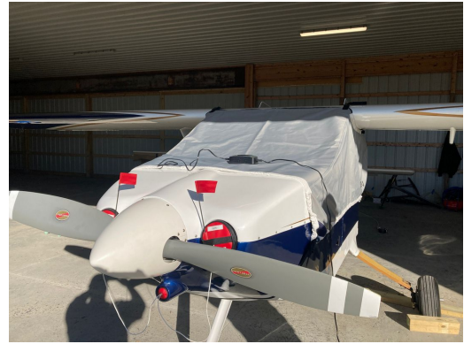
Bede BD-4 Travel Cover, Light Weight Canopy Cover, Wrap-Around