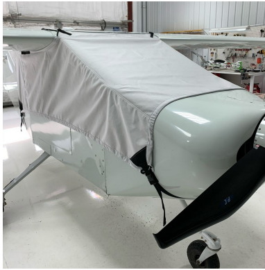
Bede BD-4 Canopy Cover

water resistance, UV resistance and anti-static buildup. The inner lining is a very soft and smooth microfiber to prevent scratching. The material is very reflective, and tests show that the cabin interior temperature can be reduced to near-ambient temperature on the hottest of days. It is water, ice and snow repellent, yet breathable to allow moisture to escape from between the cover and the aircraft surface.