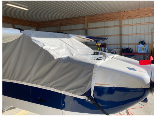
Bede BD-4 Travel Cover, Light Weight Canopy Cover, Wrap-Around