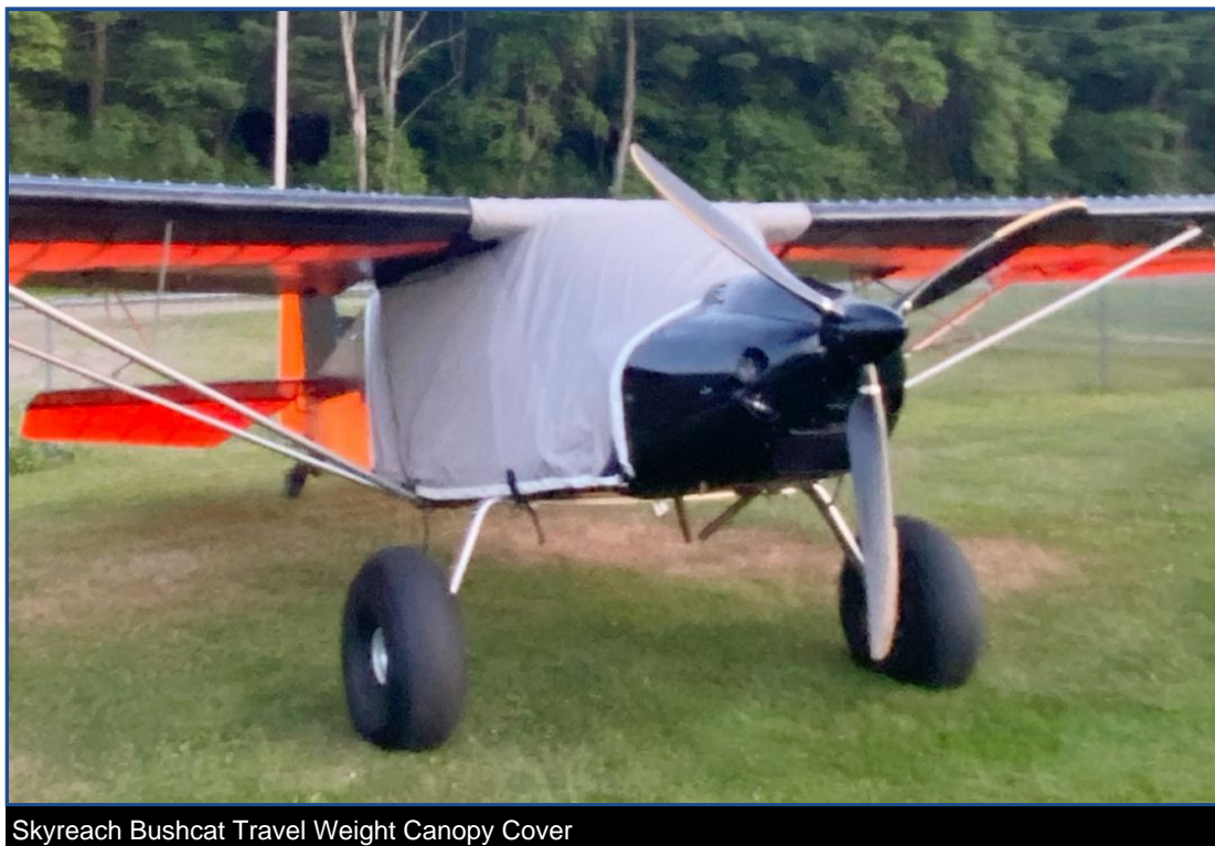
Skyreach Bushcat Travel Weight Canopy Cover