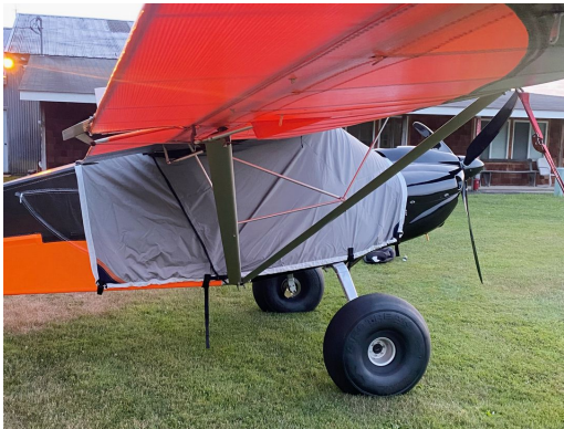
Skyreach Bushcat Travel Weight Canopy Cover

Travel Covers are made with Silver Solution-Dyed Polyester fabric and only lined over the windshield to save weight. The material is lightweight and more compact for easy stowage in the aircraft. The polyester material is water resistant, but only intended for occasional use outside. We also have an ultra lightweight material available for fitted hangar dust covers. For daily outdoor use, the non-travel Sunbrella Cover is the best choice.