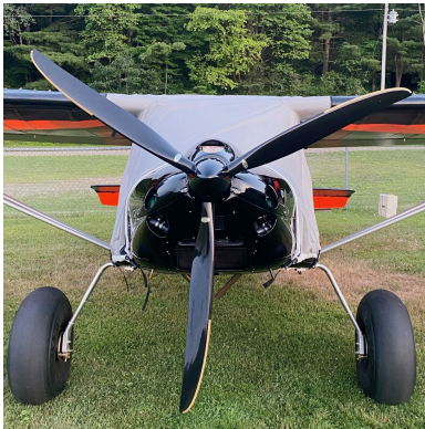
Skyreach Bushcat Travel Weight Canopy Cover