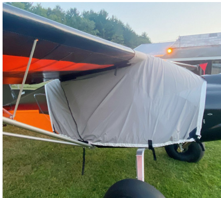
Skyreach Bushcat Travel Weight Canopy Cover