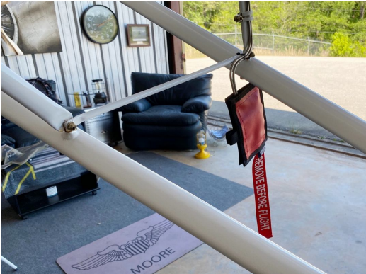
Bellanca Citabria Pitot Cover

Engine Inlet Plugs are custom fit for your Bellanca (American Champion) Citabria, Scout, Explorer intakes, made with heavy-duty vinyl material, and stuffed with a single block of sculpted urethane foam. Each plug has a zipper that allows the foam to be removed and dried if necessary. Engine plugs have warning flags that are visible from the cockpit or 'remove before flight' streamers sewn onto the face of the plugs. Most plugs are imprinted with the aircraft registration number in black for an extra charge. Storage bag NOT included. Engine plugs may be inserted after flight when the engine is still warm. Engine Inlet Plugs are commonly referred to as Cowl Plugs, Intake Plugs, Cowl Blocks, Engine Blocks, and Engine Bunges.