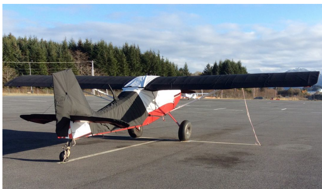
Bellanca Scout 8GCBC Canopy, Wing & Empennage Covers