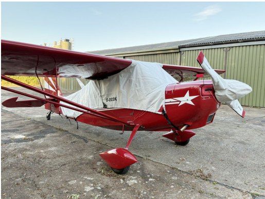
Super Decathlon Canopy Cover, Over-Top with Ext. to Tail, Prop Cover, Engine Plugs.

Engine Inlet Plugs are custom fit for your Bellanca (American Champion) Citabria, Scout, Explorer intakes, made with heavy-duty vinyl material, and stuffed with a single block of sculpted urethane foam. Each plug has a zipper that allows the foam to be removed and dried if necessary. Engine plugs have warning flags that are visible from the cockpit or 'remove before flight' streamers sewn onto the face of the plugs. Most plugs are imprinted with the aircraft registration number in black for an extra charge. Storage bag NOT included. Engine plugs may be inserted after flight when the engine is still warm. Engine Inlet Plugs are commonly referred to as Cowl Plugs, Intake Plugs, Cowl Blocks, Engine Blocks, and Engine Bungs.