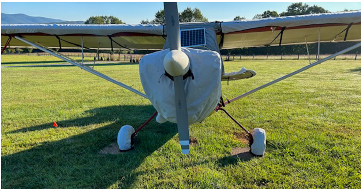
Citabria Engine, Tire & Wing Covers

ALL-YEAR USE MATERIAL - Made with Silver Acrylic Sunbrella canvas, the all-year use material is the best option for sun protection and cover longevity. This heavier more durable material is intended for all weather conditions, such as rain and snow or lots of sun.