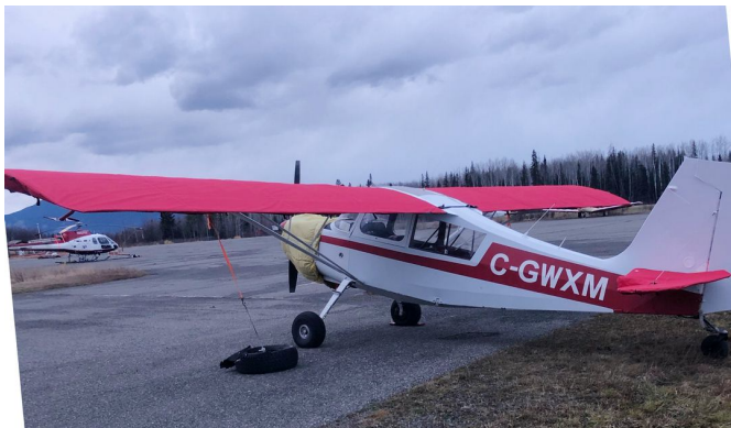
Bellanca Scout 8GCBC Wing & Horizontal Stabilizer Covers

WINTER USE MATERIAL - Made with Solution-Dyed Polyester fabric, this option is intended for seasonal use to aid in deicing, rain mitigation, or for occasional travel. The material is lighter and more compact, but more susceptible to UV damage and may have a shorter useful life if used continuously outside than the all-year use material.