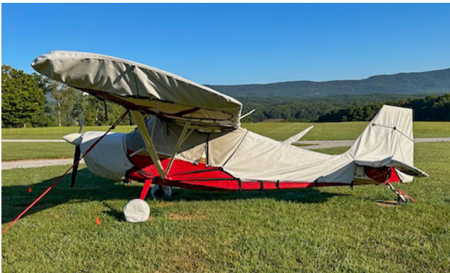
Citabria Cover Set