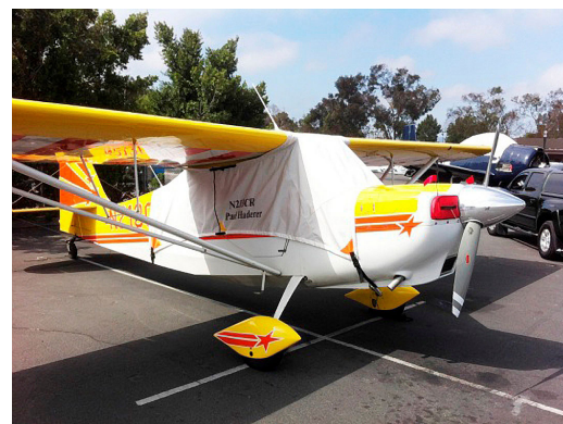
Bellanca Citabria Over-Top Canopy Cover