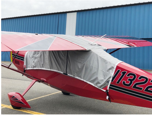
Bellanca Decathlon Travel Canopy Cover

This cover type is made from Silver Acrylic Sunbrella canvas and is 100% lined with a soft and smooth microfiber. Bruce's Custom Covers developed this material combination especially for aircraft protection. The outer material is medium weight and treated for water resistance, UV resistance and anti-static buildup. The inner lining is a very soft and smooth microfiber to prevent scratching. The material is very reflective, and tests show that the cabin interior temperature can be reduced to near-ambient temperature on the hottest of days. It is water, ice and snow repellent, yet breathable to allow moisture to escape from between the cover and the aircraft surface.