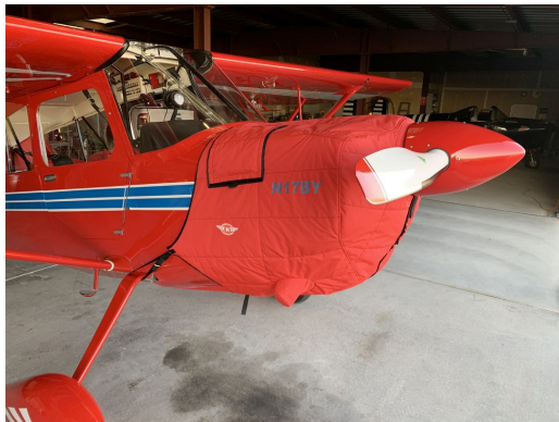
American Champion 8KCAB Insulated Engine Cover

This cover type is made from Silver Acrylic Sunbrella canvas and is 100% lined with a soft and smooth microfiber. Bruce's Custom Covers developed this material combination especially for aircraft protection. The outer material is medium weight and treated for water resistance, UV resistance and anti-static buildup. The inner lining is a very soft and smooth microfiber to prevent scratching. The material is very reflective, and tests show that the cabin interior temperature can be reduced to near-ambient temperature on the hottest of days. It is water, ice and snow repellent, yet breathable to allow moisture to escape from between the cover and the aircraft surface.