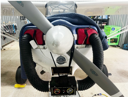
Citabria Engine Inlet Plugs with Aerotherm heater hose cutouts.