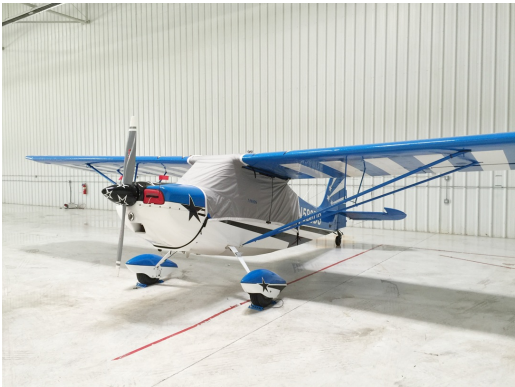
Bellanca Citabria Light Weight Travel Cover, Engine Plugs

This cover type is made from Silver Acrylic Sunbrella canvas and is 100% lined with a soft and smooth microfiber. Bruce's Custom Covers developed this material combination especially for aircraft protection. The outer material is medium weight and treated for water resistance, UV resistance and anti-static buildup. The inner lining is a very soft and smooth microfiber to prevent scratching. The material is very reflective, and tests show that the cabin interior temperature can be reduced to near-ambient temperature on the hottest of days. It is water, ice and snow repellent, yet breathable to allow moisture to escape from between the cover and the aircraft surface.