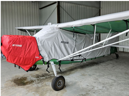
Citabria 7ECA Extended Canopy, Empennage, Wings, & Insulated Engine Cover

This cover type is made from Silver Acrylic Sunbrella canvas and is 100% lined with a soft and smooth microfiber. Bruce's Custom Covers developed this material combination especially for aircraft protection. The outer material is medium weight and treated for water resistance, UV resistance and anti-static buildup. The inner lining is a very soft and smooth microfiber to prevent scratching. The material is very reflective, and tests show that the cabin interior temperature can be reduced to near-ambient temperature on the hottest of days. It is water, ice and snow repellent, yet breathable to allow moisture to escape from between the cover and the aircraft surface.