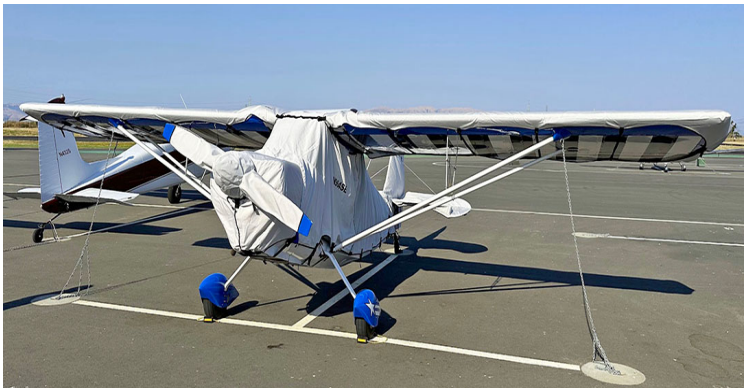
Bellanca Decathlon Cover Set