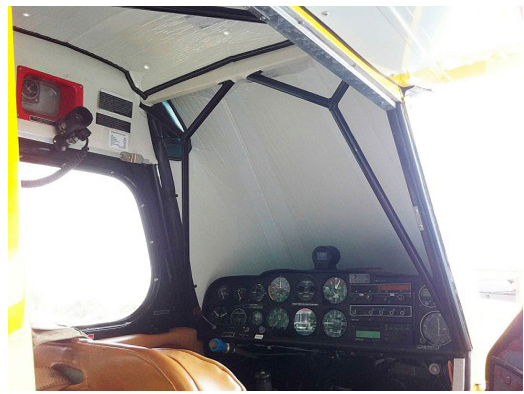
Bellanca Citabria Windshield & Skylight HeatShields