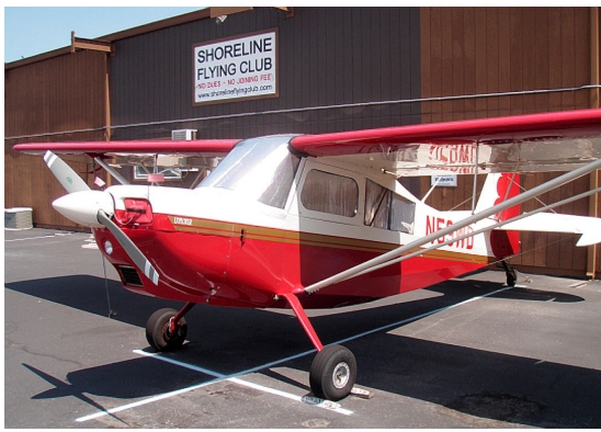
Bellanca Citabria Cabin HeatShield Set