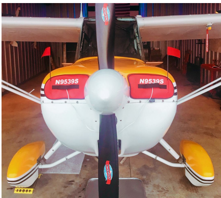
Bellanca Citabria 7ECA Engine Inlet Plugs