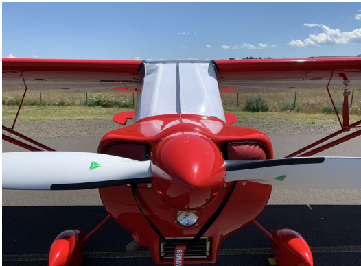
Bellanca Decathlon 8KCAB Heatshield Set with white side out

more effective and practical for long-term protection.