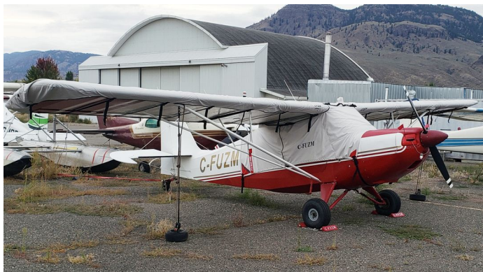
1966 Bellanca Citabria Champion 7ECA Antique Style Pitot Tubes

Engine Inlet Plugs are custom fit for your Bellanca (American Champion) Citabria, Scout, Explorer intakes, made with heavy-duty vinyl material, and stuffed with a single block of sculpted urethane foam. Each plug has a zipper that allows the foam to be removed and dried if necessary. Engine plugs have warning flags that are visible from the cockpit or 'remove before flight' streamers sewn onto the face of the plugs. Most plugs are imprinted with the aircraft registration number in black for an extra charge. Storage bag NOT included. Engine plugs may be inserted after flight when the engine is still warm. Engine Inlet Plugs are commonly referred to as Cowl Plugs, Intake Plugs, Cowl Blocks, Engine Blocks, and Engine Bungs.