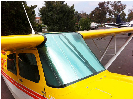
Bellanca Citabria Windshield HeatShield