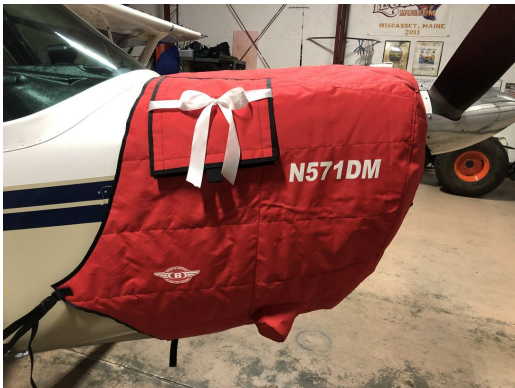
Bellanca Citabria Insulated Engine Cover

This cover type is made from Silver Acrylic Sunbrella canvas and is 100% lined with a soft and smooth microfiber. Bruce's Custom Covers developed this material combination especially for aircraft protection. The outer material is medium weight and treated for water resistance, UV resistance and anti-static buildup. The inner lining is a very soft and smooth microfiber to prevent scratching. The material is very reflective, and tests show that the cabin interior temperature can be reduced to near-ambient temperature on the hottest of days. It is water, ice and snow repellent, yet breathable to allow moisture to escape from between the cover and the aircraft surface.