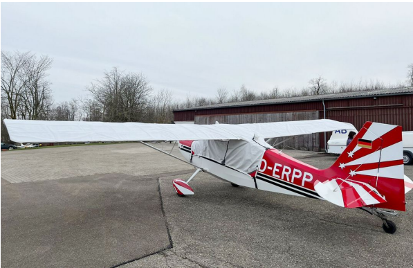
American Champion Citabria Over-Top Canopy Cover

WINTER USE MATERIAL - Made with Solution-Dyed Polyester fabric, this option is intended for seasonal use to aid in deicing, rain mitigation, or for occasional travel. The material is lighter and more compact, but more susceptible to UV damage and may have a shorter useful life if used continuously outside than the all-year use material.