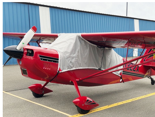
Bellanca Decathlon Travel Canopy Cover