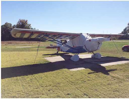
Bellanca Decathlon Canopy, Wing, Engine, Empennage, & Wheelpanit Covers.