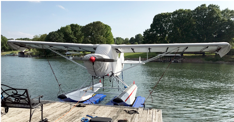
Bellanca Champion 7EC Full Cover Set