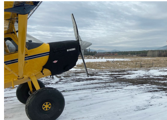
Bellanca Scout Insulated Engine & Prop Covers