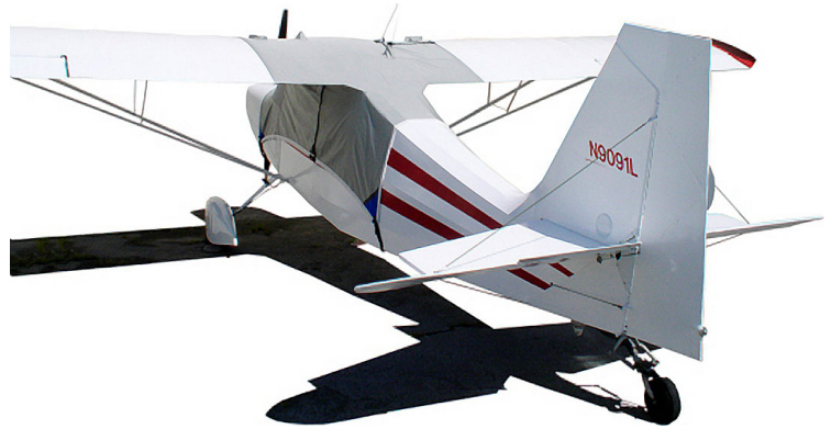
Bellanca Citabria Over-Top Canopy, extended to cover gas caps