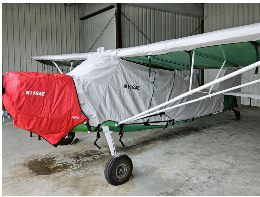
Citabria 7ECA Extended Canopy, Empennage, Wings, & Insulated Engine Cover