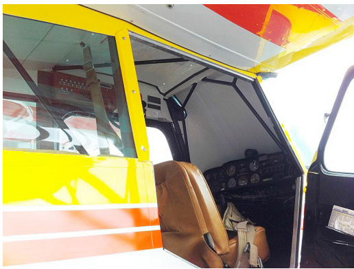
Bellanca Citabria Windshield & Skylight HeatShields