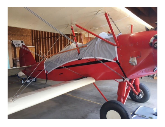
Bird BK Travel Canopy Cover