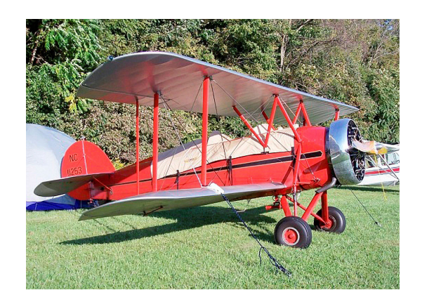
Waco ASO Canopy Cover