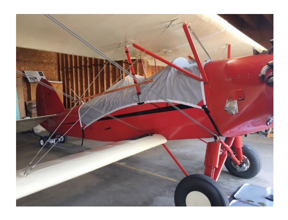
Bird BK Travel Canopy Cover