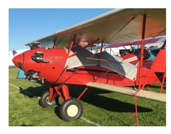
Bird BK Travel Canopy Cover

Travel Covers are made with Silver Solution-Dyed Polyester fabric and only lined over the windshield to save weight. The material is lightweight and more compact for easy stowage in the aircraft. The polyester material is water resistant, but only intended for occasional use outside. We also have an ultra lightweight material available for fitted hangar dust covers. For daily outdoor use, the non-travel Sunbrella Cover is the best choice.