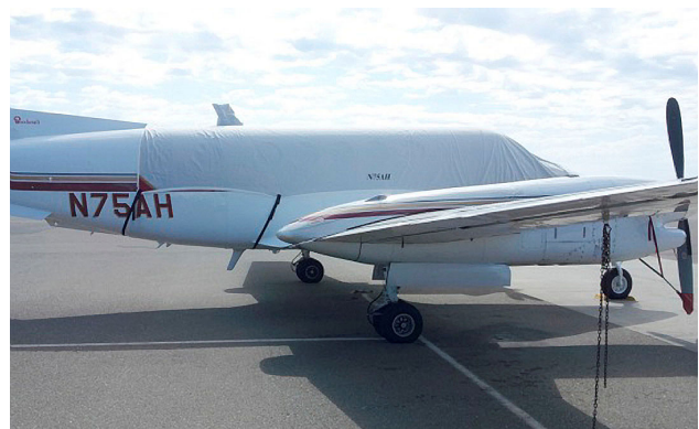
King Air 350 Canopy Cover