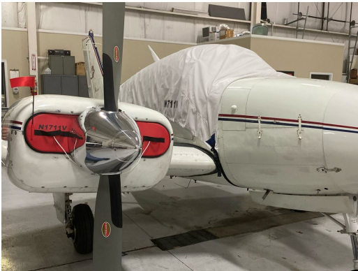
Beech Travel Air Engine Plugs

Engine Inlet Plugs are custom fit for your Beech Travel Air B95 intakes, made with heavy-duty vinyl material, and stuffed with a single block of sculpted urethane foam. Each plug has a zipper that allows the foam to be removed and dried if necessary. Engine plugs have warning flags that are visible from the cockpit or 'remove before flight' streamers sewn onto the face of the plugs. Most plugs are imprinted with the aircraft registration number in black for an extra charge. Storage bag NOT included. Engine plugs may be inserted after flight when the engine is still warm. Engine Inlet Plugs are commonly referred to as Cowl Plugs, Intake Plugs, Cowl Blocks, Engine Blocks, and Engine Bungs.