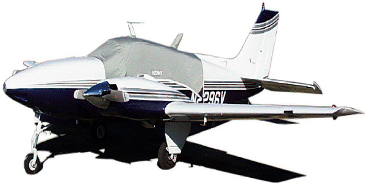
Beech Baron Canopy Cover