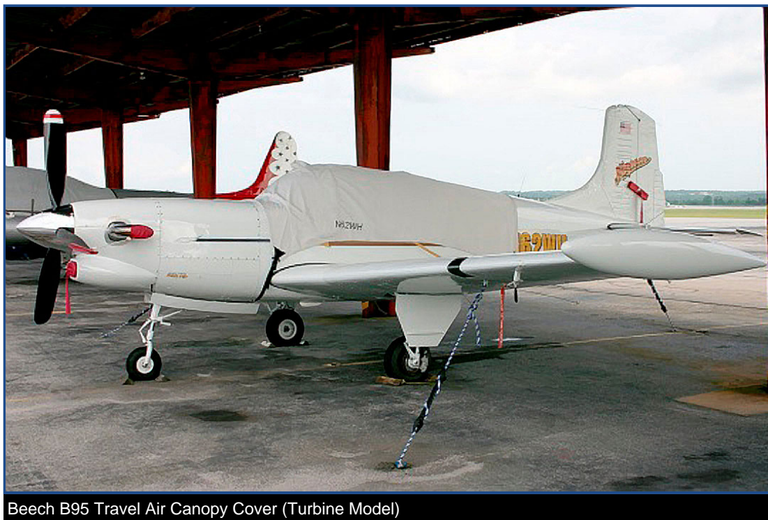
Beech B95 Travel Air Canopy Cover (Turbine Model)