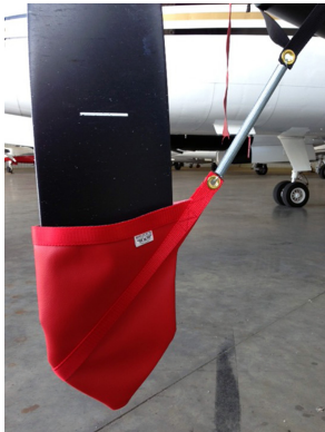
King Air Prop Tie