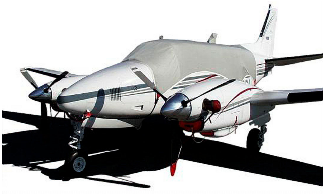
King Air Canopy Cover, Engine Plugs, Prop-Tie/Exhaust Covers