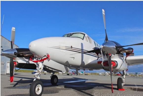
King Air C90A Engine Plugs and Pitot Covers