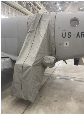
King Air Airstair Coor Cover