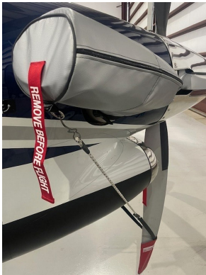
Beech King Air 90 Prop Tie-Downs/Exhaust Covers

This cover type is made from Silver Acrylic Sunbrella canvas and is 100% lined with a soft and smooth microfiber. Bruce's Custom Covers developed this material combination especially for aircraft protection. The outer material is medium weight and treated for water resistance, UV resistance and anti-static buildup. The inner lining is a very soft and smooth microfiber to prevent scratching. The material is very reflective, and tests show that the cabin interior temperature can be reduced to near-ambient temperature on the hottest of days. It is water, ice and snow repellent, yet breathable to allow moisture to escape from between the cover and the aircraft surface.