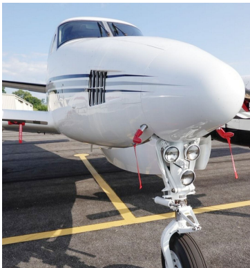
Beech King Air C90 Pitot Covers, Heat Exchanger Plugs

Engine Inlet Plugs are custom fit for your Beech King Air 90 & 100 (U-21, RU-21, T-44) intakes, made with heavy-duty vinyl material, and stuffed with a single block of sculpted urethane foam. Each plug has a zipper that allows the foam to be removed and dried if necessary. Engine plugs have warning flags that are visible from the cockpit or 'remove before flight' streamers sewn onto the face of the plugs. Most plugs are imprinted with the aircraft registration number in black for an extra charge. Storage bag NOT included. Engine plugs may be inserted after flight when the engine is still warm. Engine Inlet Plugs are commonly referred to as Cowl Plugs, Intake Plugs, Cowl Blocks, Engine Blocks, and Engine Bungs.