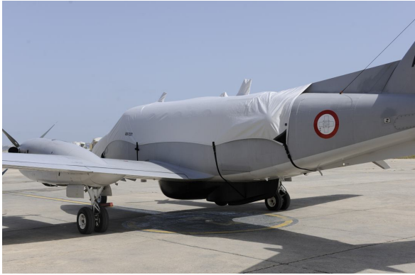
King Air 200 Canopy/Nose Cover