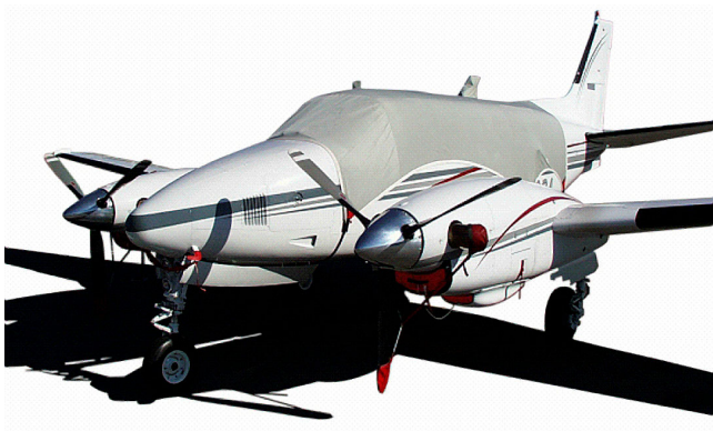
King Air Canopy Cover, Engine Plugs, Prop-Tie/Exhaust Covers

Travel Covers are made with Silver Solution-Dyed Polyester fabric and only lined over the windshield to save weight. The material is lightweight and more compact for easy stowage in the aircraft. The polyester material is water resistant, but only intended for occasional use outside. We also have an ultra lightweight material available for fitted hangar dust covers. For daily outdoor use, the non-travel Sunbrella Cover is the best choice.