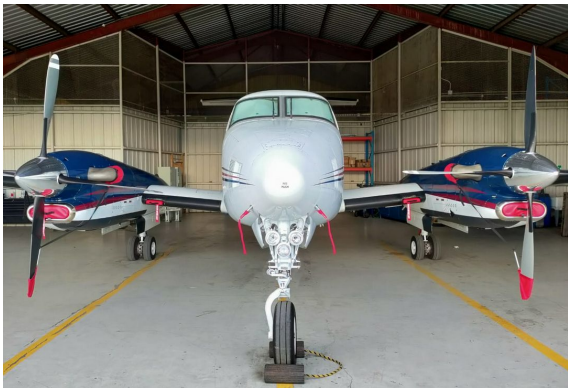
Beech King Air Prop Tie-Downs/Exhaust Covers