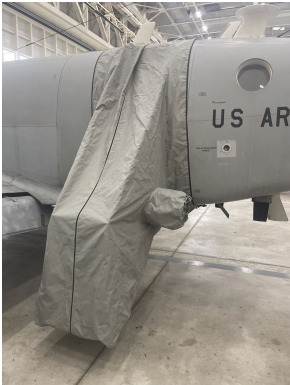
King Air Airstair Coor Cover

WINTER USE MATERIAL - Made with Solution-Dyed Polyester fabric, this option is intended for seasonal use to aid in deicing, rain mitigation, or for occasional travel. The material is lighter and more compact, but more susceptible to UV damage and may have a shorter useful life if used continuously outside than the all-year use material.