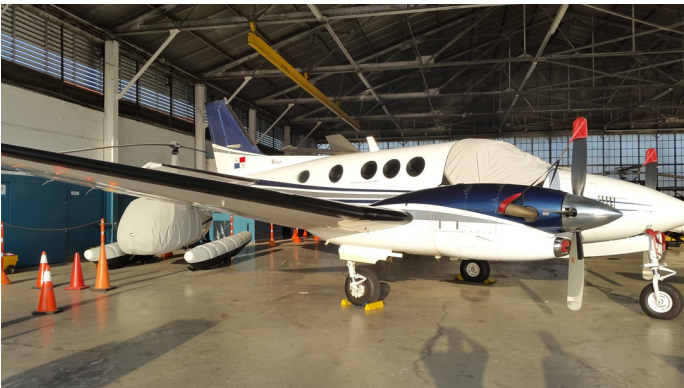
Raytheon Beech King Air Cockpit Cover, Prop Tie/Exhaust Covers, Inlet Plugs