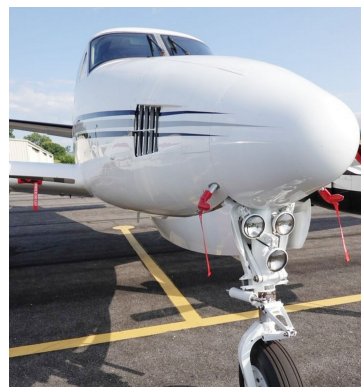
Beech King Air C90 Pitot Covers, Heat Exchanger Plugs