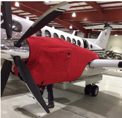
Beech King Air 200 Insulated Engine Cover