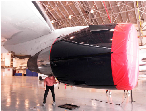
Boeing 767 Intake Covers Ship Set