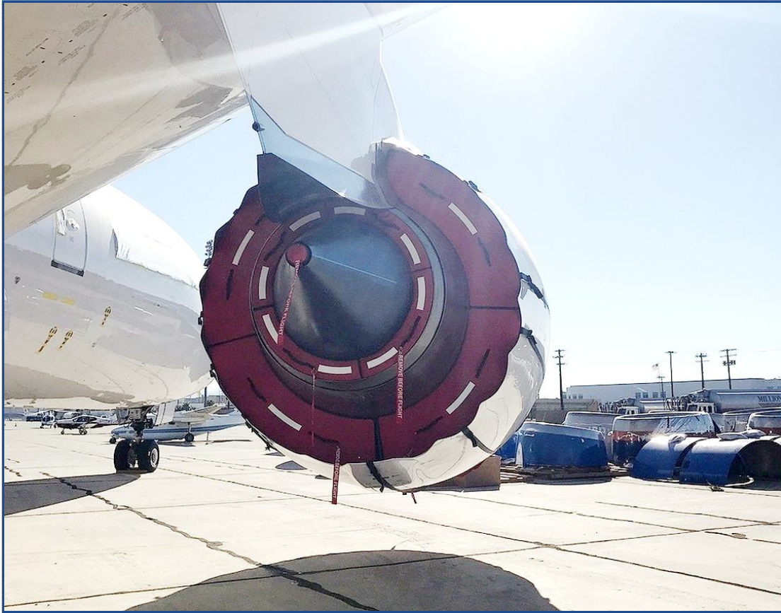
Boeing 787 Dreamliner Bypass Vent, Turbine Exhaust, & Exhaust Nozzle Plugs, Genx Engines