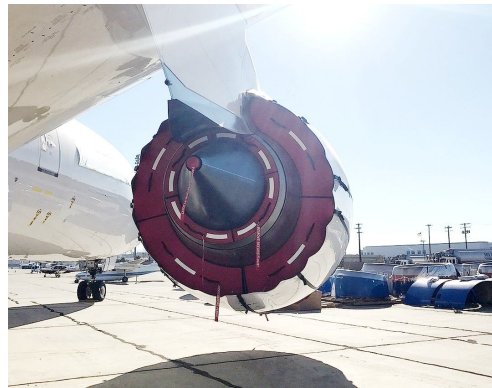
Boeing 787 Dreamliner Bypass Vent, Turbine Exhaust, & Exhaust Nozzle Plugs, Genx Engines