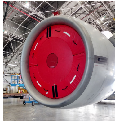
Boeing 777 Intake Plugs, Folding Type