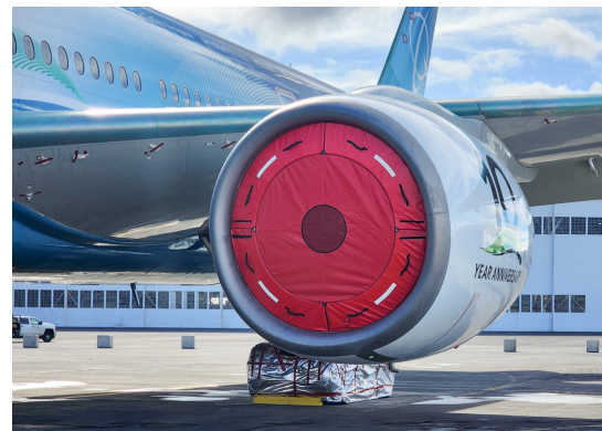
Boeing 777 Intake Plugs, framed, Bi-fold design.