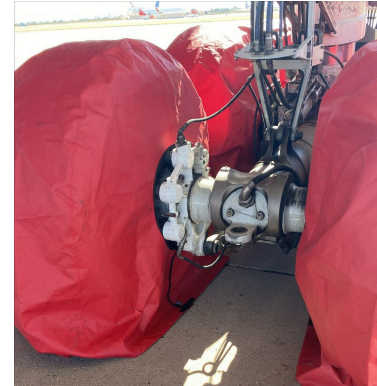
Boeing 777 Main Gear Tire Covers