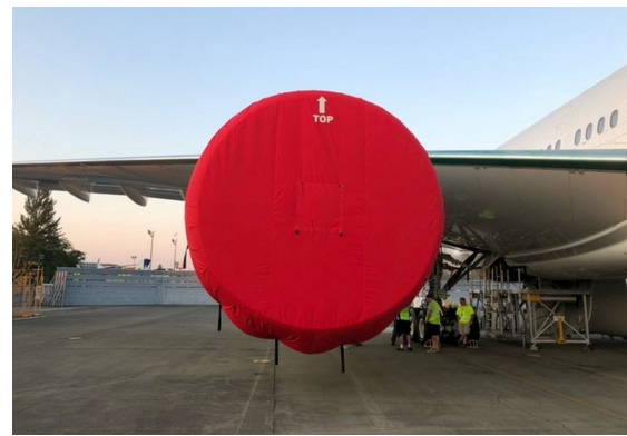
Boeing 777 Intake Covers, GE9X Engine