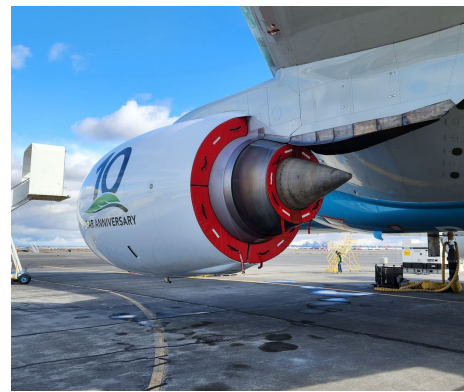
Boeing 777 Bypass Plugs & Turbine Exhaust Plugs, RR Trent 800 Engines