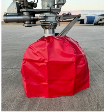
Boeing 777 Nose Gear Tire Covers

ALL-YEAR USE MATERIAL - Made with Silver Acrylic Sunbrella canvas, the all-year use material is the best option for sun protection and cover longevity. This heavier more durable material is intended for all weather conditions, such as rain and snow or lots of sun.