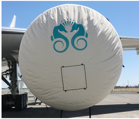
Boeing 777 Intake Covers, GE Engine