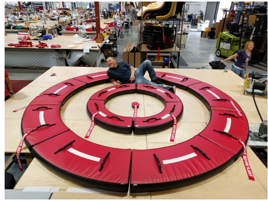
Boeing 777 Exhaust Plug Set