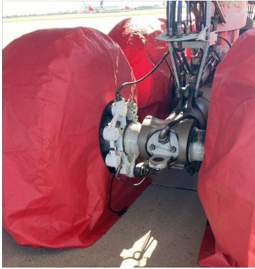
Boeing 777 Main Gear Tire Covers