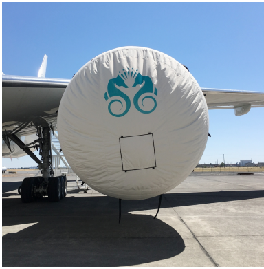
Boeing 777 Intake Covers, GE Engine