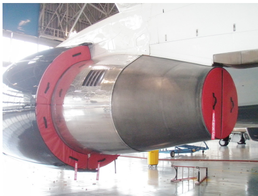
Exhaust Plugs Ship Set, incl. Fan Thrust Reverser and Exhaust Plugs P/N: B767-200