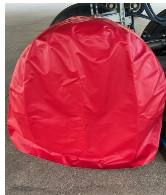
Boeing 777 Main Gear Tire Covers