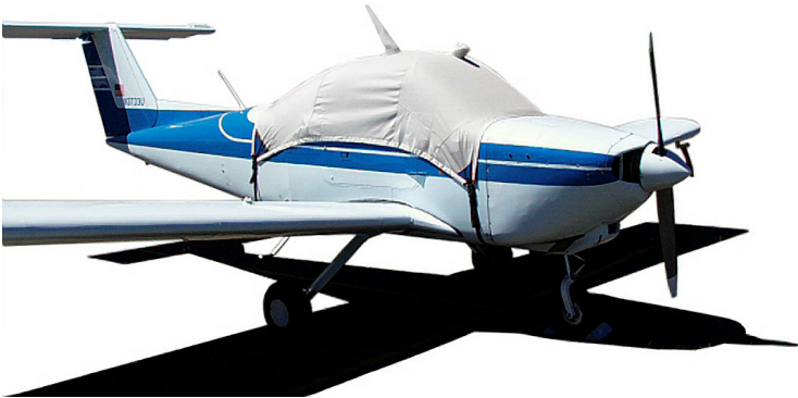
Canopy Cover for Beech Skipper

Travel Covers are made with Silver Solution-Dyed Polyester fabric and only lined over the windshield to save weight. The material is lightweight and more compact for easy stowage in the aircraft. The polyester material is water resistant, but only intended for occasional use outside. We also have an ultra lightweight material available for fitted hangar dust covers. For daily outdoor use, the non-travel Sunbrella Cover is the best choice.