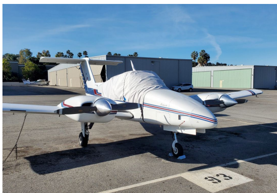
Beech Duchess Canopy Cover

This cover type is made from Silver Acrylic Sunbrella canvas and is 100% lined with a soft and smooth microfiber. Bruce's Custom Covers developed this material combination especially for aircraft protection. The outer material is medium weight and treated for water resistance, UV resistance and anti-static buildup. The inner lining is a very soft and smooth microfiber to prevent scratching. The material is very reflective, and tests show that the cabin interior temperature can be reduced to near-ambient temperature on the hottest of days. It is water, ice and snow repellent, yet breathable to allow moisture to escape from between the cover and the aircraft surface.