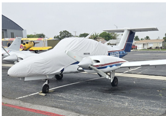
Beech 76 Duchess Canopy/Nose Cover