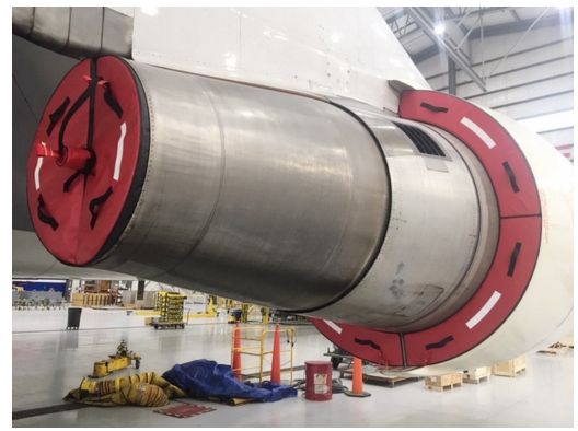
Boeing 747 Bypass Vent & Turbine Exhaust Pugs