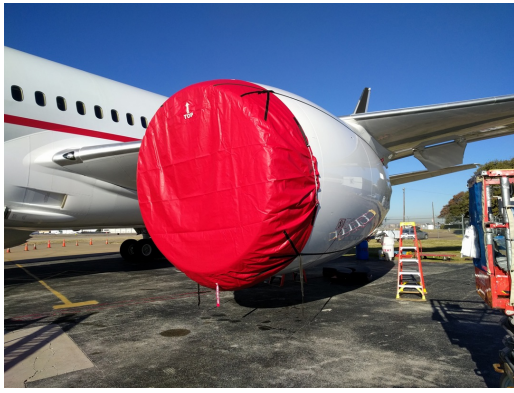
Boeing 787 Intake Cover