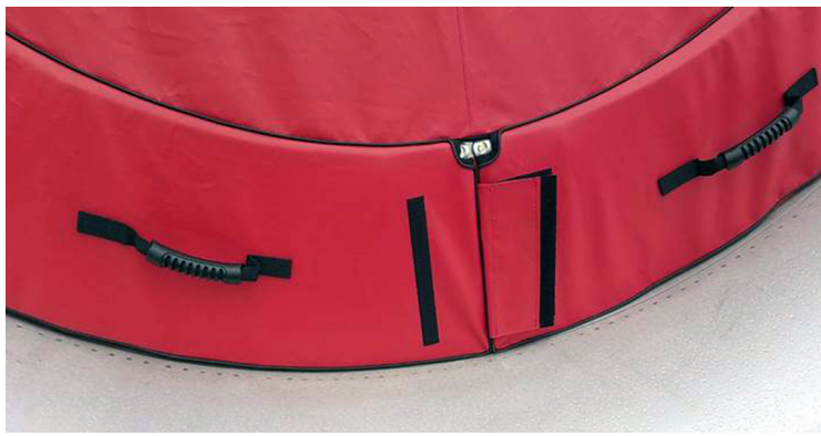
Boeing 747 Intake Plugs, Genx Engines, Framed Bi-Fold Type