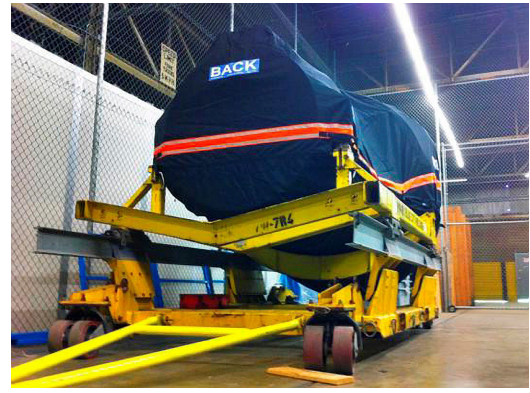
QEC Off-link Engine Cover / Tarp / Bag