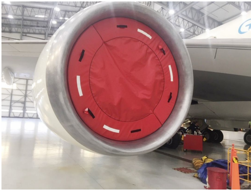
Boeing 747 Intake Plug