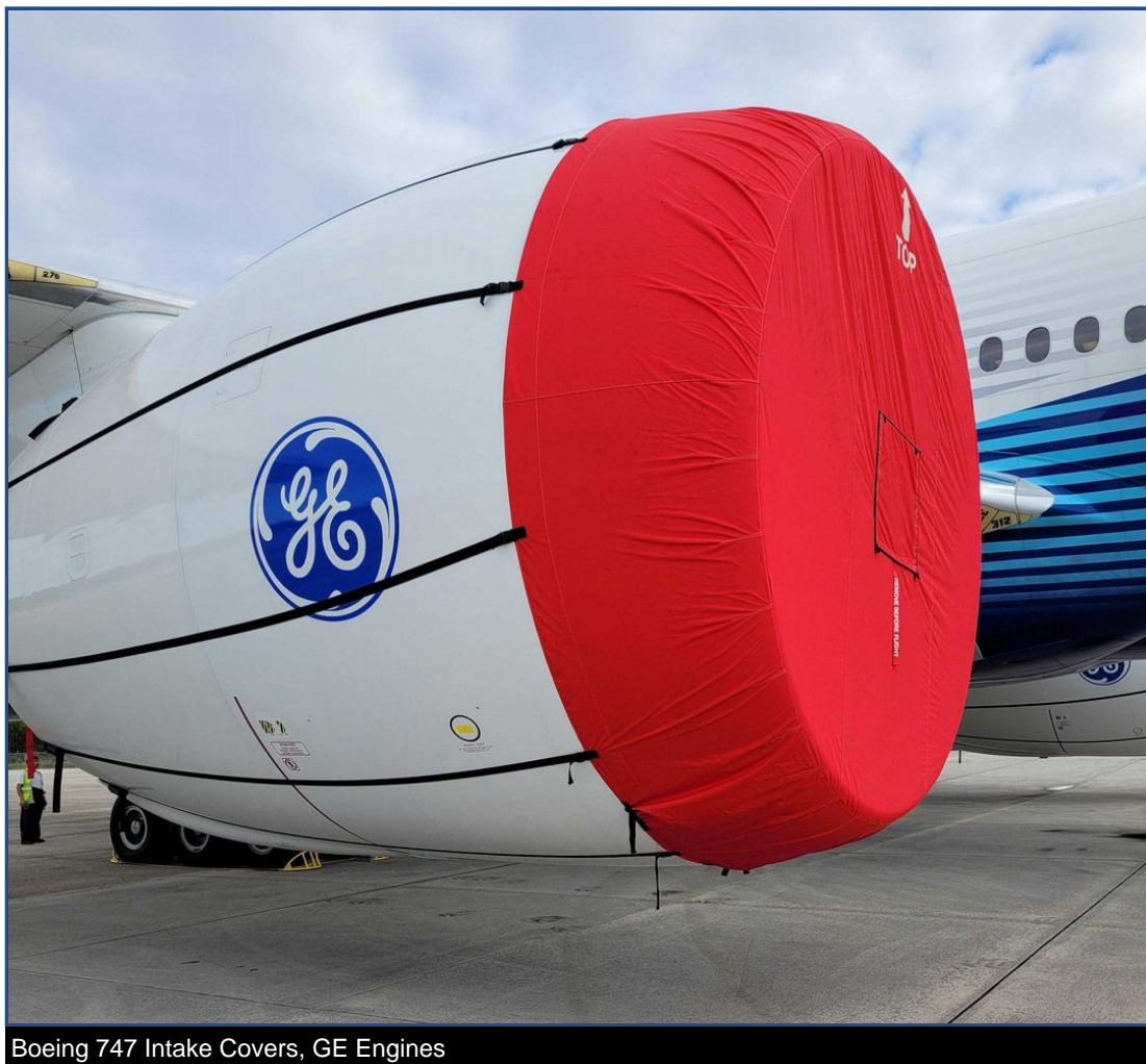
Boeing 747 Intake Covers, GE Engines