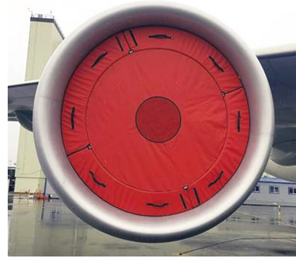
Boeing 747 Intake Plugs, Genx Engines, Framed Bi-Fold Type