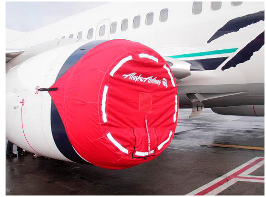
Boeing 737 FOD protection Intake Plug, folding type