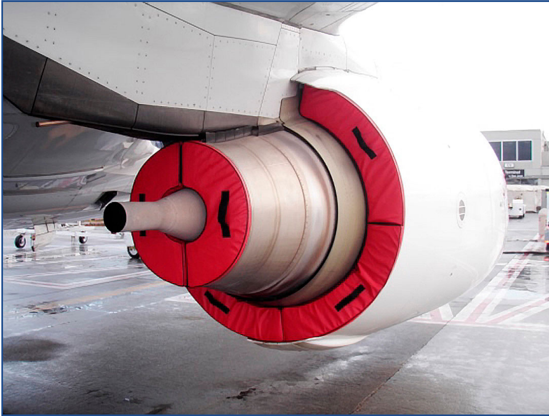
Exhaust Plug Set, folding donut ring type (Shown on NexGen Boeing 737)