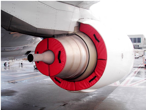
Boeing 737 NG Exhaust Plug Set, Folding Donut Ring Type

warm. Engine Inlet Plugs are commonly referred to as Cowl Plugs, Intake Plugs, Cowl Blocks, Engine Blocks, and Engine Bungs.