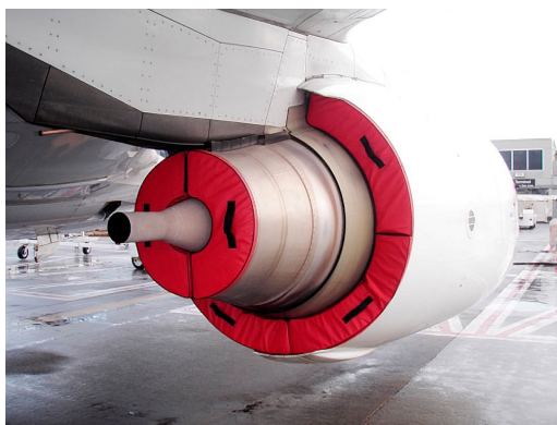
Exhaust Plug Set, folding donut ring type (Shown on NexGen Boeing 737)