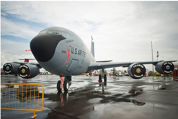
KC-135 Intake Covers, "Tambourine" type