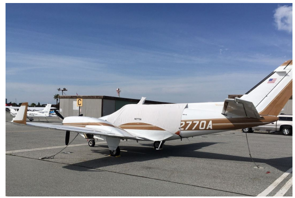
Beech Duke Canopy Cover