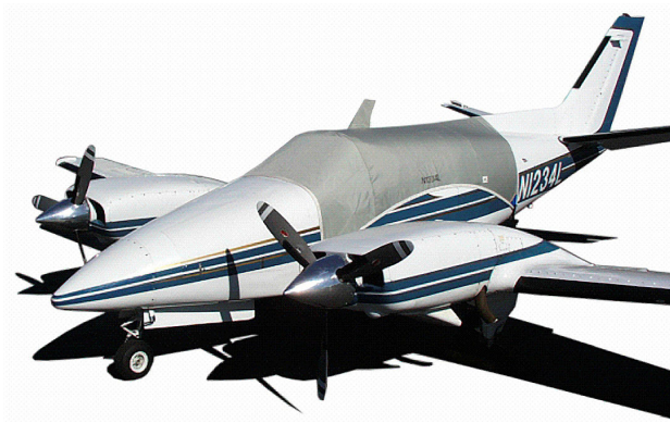
Beech Duke Standard Canopy Cover