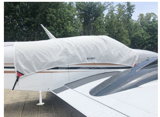
Baron G58 Travel Cover