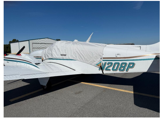
Beech 58 Canopy Cover