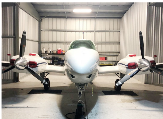
Beech Baron Engine Plugs