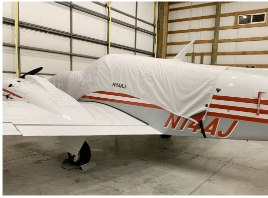
Beech Baron 58 Canopy/Nose Cover