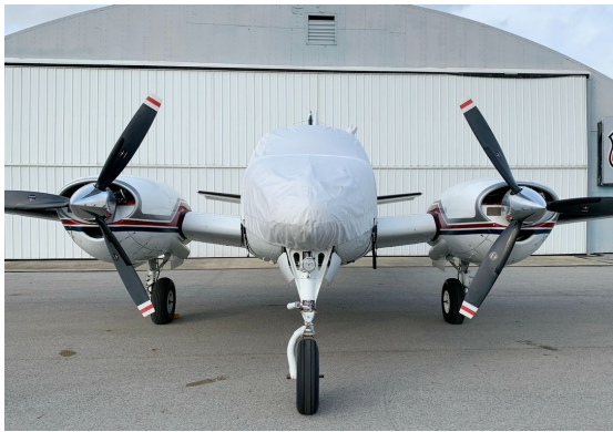
Beech Twin Bonanza Canopy/Nose Cover

This cover type is made from Silver Acrylic Sunbrella canvas and is 100% lined with a soft and smooth microfiber. Bruce's Custom Covers developed this material combination especially for aircraft protection. The outer material is medium weight and treated for water resistance, UV resistance and anti-static buildup. The inner lining is a very soft and smooth microfiber to prevent scratching. The material is very reflective, and tests show that the cabin interior temperature can be reduced to near-ambient temperature on the hottest of days. It is water, ice and snow repellent, yet breathable to allow moisture to escape from between the cover and the aircraft surface.