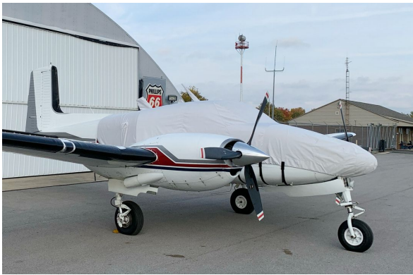
Beech Twin Bonanza Canopy/Nose Cover