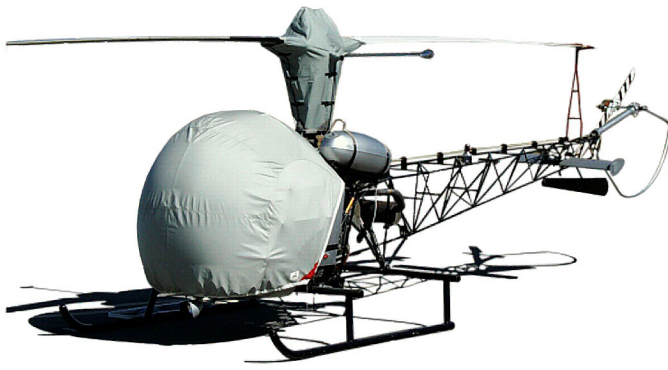
Bubble and Main Rotor Mast Covers