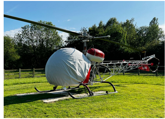
Bell 47G5 Bubble Cover