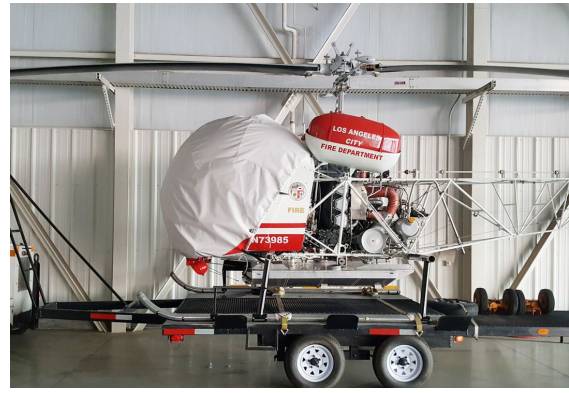
Bell 47G Bubble Cover