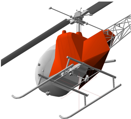
Bell 47 Engine Area Cover, 3D model

WINTER USE MATERIAL - Made with Solution-Dyed Polyester fabric, this option is intended for seasonal use to aid in deicing, rain mitigation, or for occasional travel. The material is lighter and more compact, but more susceptible to UV damage and may have a shorter useful life if used continuously outside than the all-year use material.