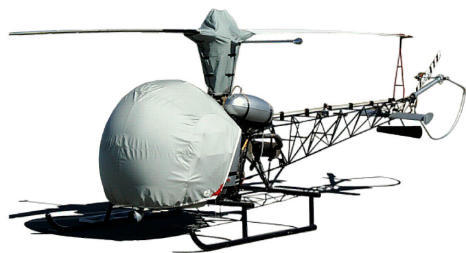
Bubble and Main Rotor Mast Covers