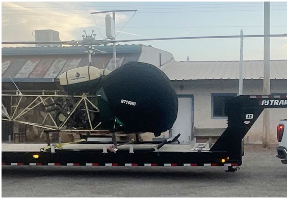
Bell 47 Bubble Cover