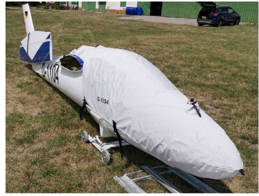
Pilatus B-4 Canopy/Nose Cover