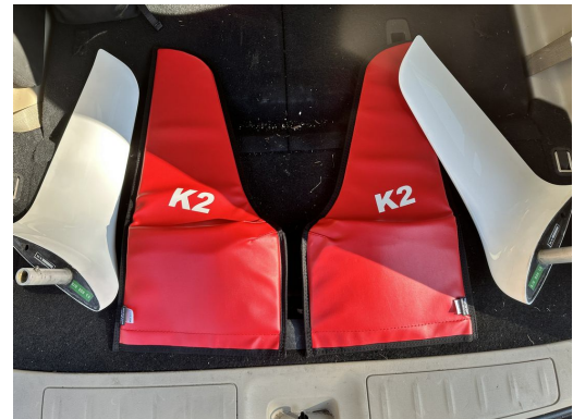
Discus CS Wingtip Pads (Set of 2)