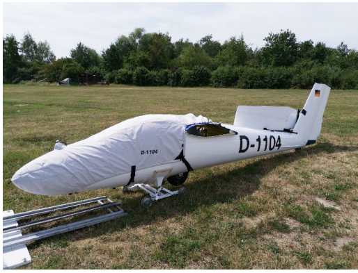
Pilatus B-4 Canopy/Nose Cover