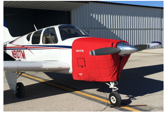
Beech Debonair Insulated Engine Cover