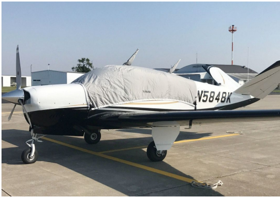
Beech Bonanza/Debonair Travel Cover, Light Weight Travel Canopy Cover