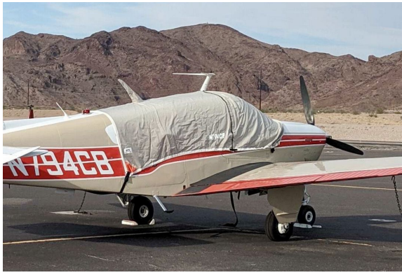
Beech Bonanza F33A Light Weight Travel Cover