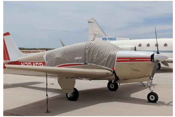
Beech Bonanza F33A Light Weight Travel Cover