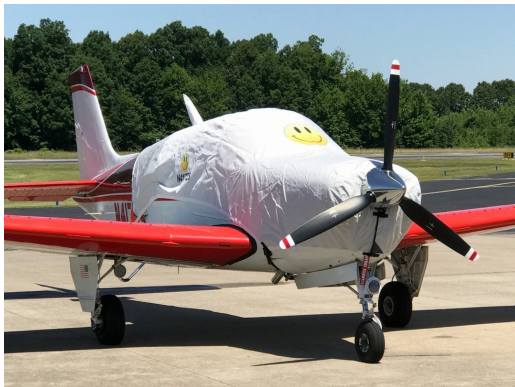
Beech Bonanza/Debonair Extended Canopy Cover (With a Smiley Face)

This cover type is made from Silver Acrylic Sunbrella canvas and is 100% lined with a soft and smooth microfiber. Bruce's Custom Covers developed this material combination especially for aircraft protection. The outer material is medium weight and treated for water resistance, UV resistance and anti-static buildup. The inner lining is a very soft and smooth microfiber to prevent scratching. The material is very reflective, and tests show that the cabin interior temperature can be reduced to near-ambient temperature on the hottest of days. It is water, ice and snow repellent, yet breathable to allow moisture to escape from between the cover and the aircraft surface.