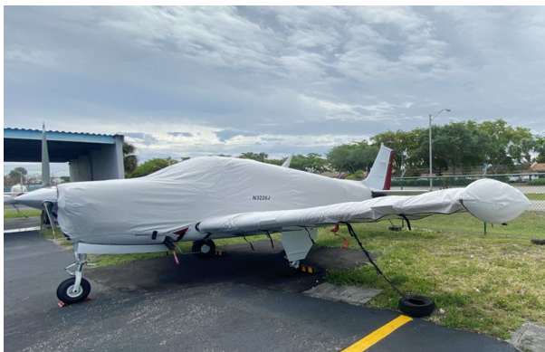
Beech Bonanza A36 Extended Canopy/Engine & Wing Covers

WINTER USE MATERIAL - Made with Solution-Dyed Polyester fabric, this option is intended for seasonal use to aid in deicing, rain mitigation, or for occasional travel. The material is lighter and more compact, but more susceptible to UV damage and may have a shorter useful life if used continuously outside than the all-year use material.