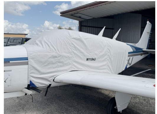
Beech A36 Bonanza Extended Canopy Cover