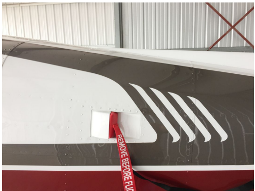
Beech Bonanza/Baron Fresh Air Intake & Exhaust Plugs

made using bright read Neoprene padded laminted (think: wetsuit material).