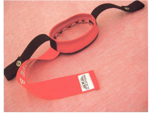
Beech 36TC Turbocharger Inlet Cover, snap-on