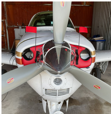
Beech A36 Engine Inlet Plugs (285HP-300HP) Large Bonanza, not for "hot prop" (set of 2), WITH HEATER HOSE INLET