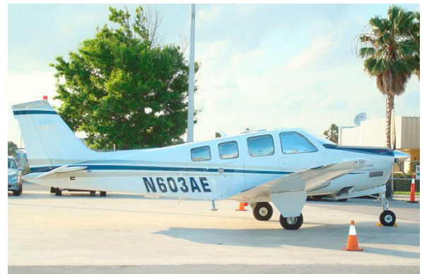
Beech Bonanza Heatshield Set