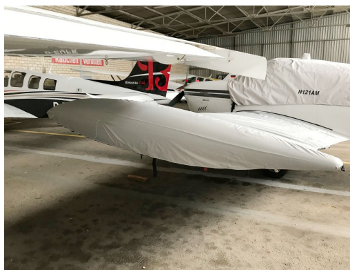
Beech Bonanza Wing Covers