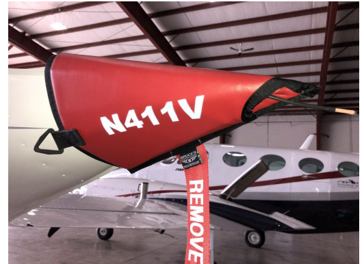
Cessna 335, 340 Wingtip Pads