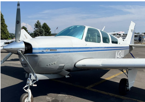
Beech Bonanza F33A Windshield HeatShield

Windshield Heatshields are interior sunshades for an aircraft's front windshield. The product is a unique composite of closed-cell foam with a silver mylar finish. The semi-rigid design is stiff enough to stand along the inside of the windshield using sun visors or window framing. It folds up flat and easily stores in the included storage sleeve. Some designs may require velcro and suction cups or split right and left sides. A Heatshield is an excellent short-term remedy for cockpit overheating. An external fabric cover is far more effective and practical for long-term protection.