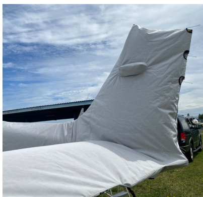
Beech Bonanza A36 Empennage Cover

WINTER USE MATERIAL - Made with Solution-Dyed Polyester fabric, this option is intended for seasonal use to aid in deicing, rain mitigation, or for occasional travel. The material is lighter and more compact, but more susceptible to UV damage and may have a shorter useful life if used continuously outside than the all-year use material.