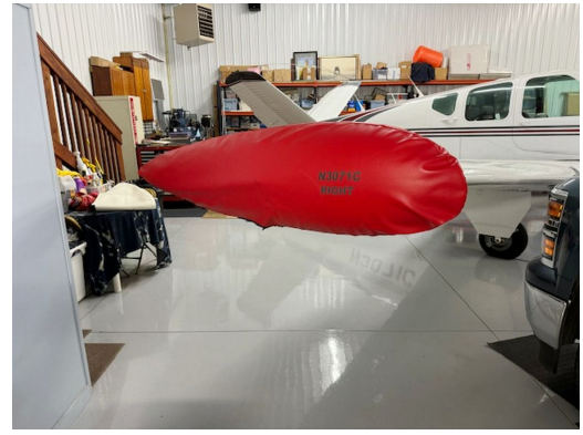
Beech K35 Bonanza Tip Tank Covers