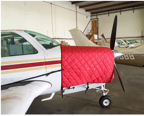
FOR INTERIOR USE. Beech Bonanza Insulated Hangar Blanket, available in Red or Silver