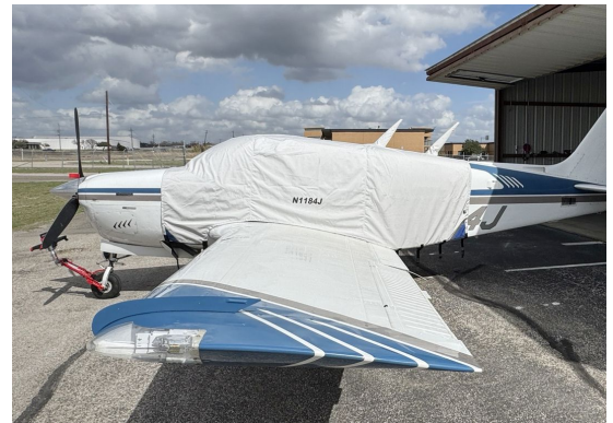
Beech A36 Bonanza Extended Canopy Cover