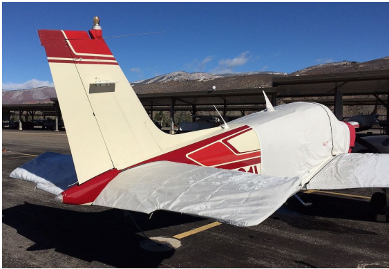
Beech Bonanza A36 Horizontal Stab, Extended Canopy, Wing Covers

Designed to prevent damage to the aircraft extremities in crowded hangars, these products are made of bright red Naugahyde and thickly padded with a sandwich of closed cell foam. Nowadays they are also made using bright red Neoprene padded laminated (think: wetsuit material).