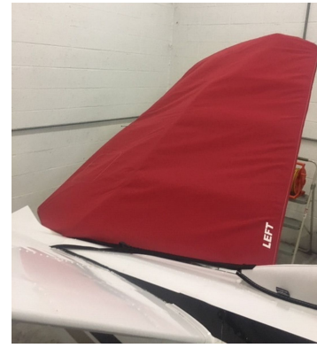
Beech V35B V-Tail Horizontal Stabilizer Cover