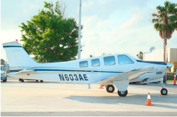
Bonanza A36 HeatShield Set

Windshield Heatshields are interior sunshades for an aircraft's front windshield. The product is a unique composite of closed-cell foam with a silver mylar finish. The semi-rigid design is stiff enough to stand along the inside of the windshield using sun visors or window framing. It folds up flat and easily stores in the included storage sleeve. Some designs may require velcro and suction cups or split right and left sides. A Heatshield is an excellent short-term remedy for cockpit overheating. An external fabric cover is far more effective and practical for long-term protection.