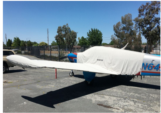
Beech Bonanza A36 Extended Canopy, Wing Covers with D'Shannon Tip Tanks