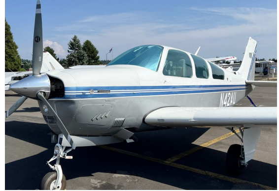
Beech Bonanza F33A Windshield HeatShield