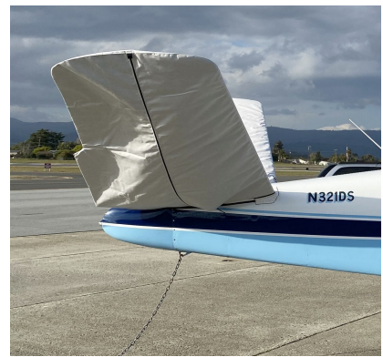
Beech V-Tail Bonanza Horizontal Stabilizer Covers