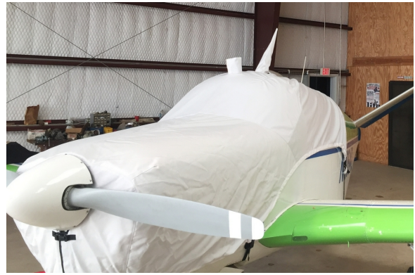
Beech Bonanza Canopy/Engine Cover