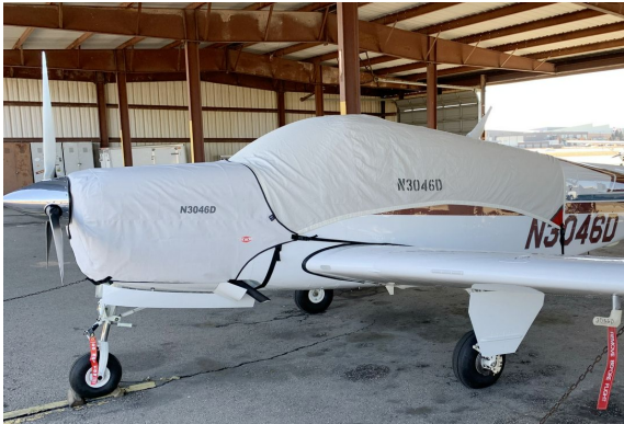
Beech Bonanza Engine Cover, Canopy Cover

This cover type is made from Silver Acrylic Sunbrella canvas and is 100% lined with a soft and smooth microfiber. Bruce's Custom Covers developed this material combination especially for aircraft protection. The outer material is medium weight and treated for water resistance, UV resistance and anti-static buildup. The inner lining is a very soft and smooth microfiber to prevent scratching. The material is very reflective, and tests show that the cabin interior temperature can be reduced to near-ambient temperature on the hottest of days. It is water, ice and snow repellent, yet breathable to allow moisture to escape from between the cover and the aircraft surface.