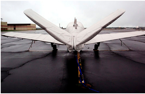
Beech Bonanza V-Tail Full Cover Set