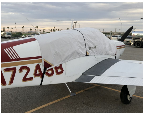
Beech J35 Bonanza Canopy Cover

Travel Covers are made with Silver Solution-Dyed Polyester fabric and only lined over the windshield to save weight. The material is lightweight and more compact for easy stowage in the aircraft. The polyester material is water resistant, but only intended for occasional use outside. We also have an ultra lightweight material available for fitted hangar dust covers. For daily outdoor use, the non-travel Sunbrella Cover is the best choice.