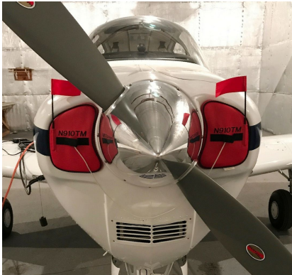
Beech Debonair Engine Inlet Plugs, early smaller style