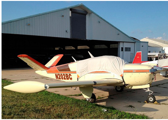
Beech Bonanza Canopy Cover