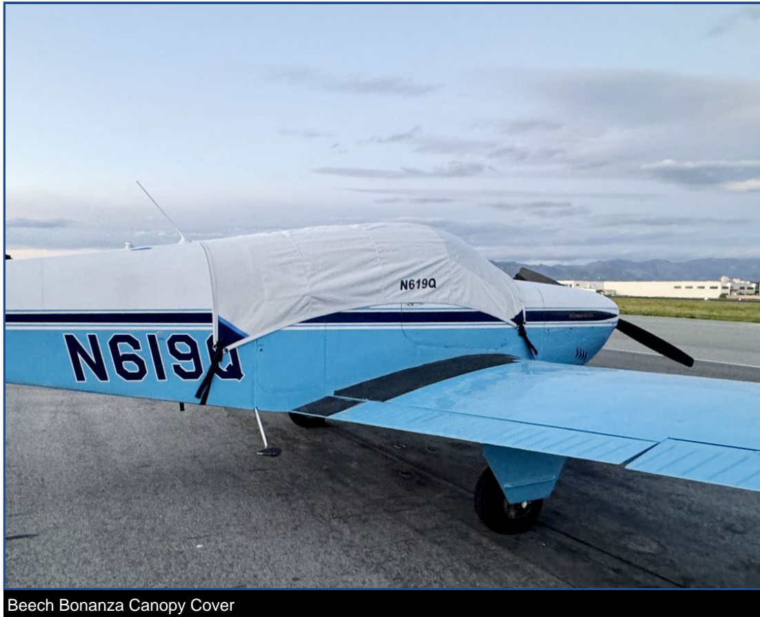
Beech Bonanza Canopy Cover