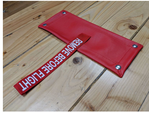
Beech Bonanza/Debonair Induction Air Filter Inlet Cover