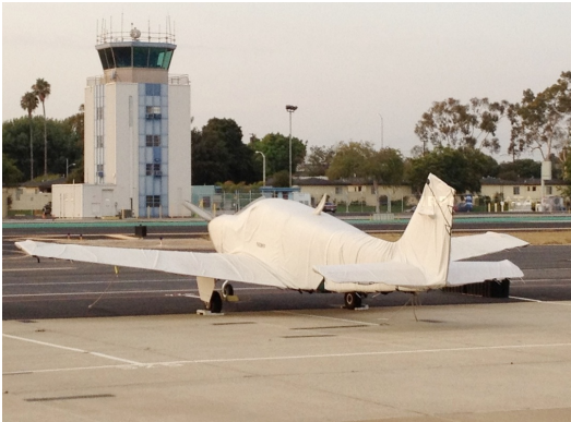
A36 Bonanza Full Cover Set

This cover type is made from Silver Acrylic Sunbrella canvas and is 100% lined with a soft and smooth microfiber. Bruce's Custom Covers developed this material combination especially for aircraft protection. The outer material is medium weight and treated for water resistance, UV resistance and anti-static buildup. The inner lining is a very soft and smooth microfiber to prevent scratching. The material is very reflective, and tests show that the cabin interior temperature can be reduced to near-ambient temperature on the hottest of days. It is water, ice and snow repellent, yet breathable to allow moisture to escape from between the cover and the aircraft surface.