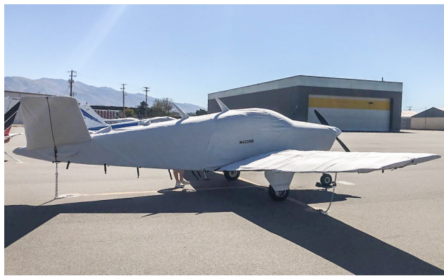
Beech F35 Wing Covers, hail protection type, All Year Use (set of 2)