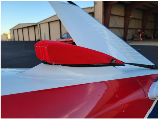
Beech Bonanza Fresh Air Intake Cover