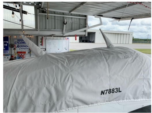
Beech Bonanza V35 Canopy Cover