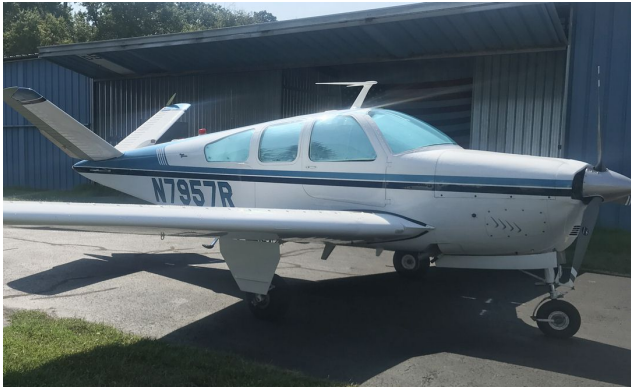
Beechcraft V35A Bonanza Heatshield Set