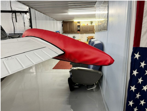
Beech K35 Bonanza Tip Tank Covers

Engine Inlet Plugs are custom fit for your Beech Bonanza/Debonair intakes, made with heavy-duty vinyl material, and stuffed with a single block of sculpted urethane foam. Each plug has a zipper that allows the foam to be removed and dried if necessary. Engine plugs have warning flags that are visible from the cockpit or 'remove before flight' streamers sewn onto the face of the plugs. Most plugs are imprinted with the aircraft registration number in black for an extra charge. Storage bag NOT included. Engine plugs may be inserted after flight when the engine is still warm. Engine Inlet Plugs are commonly referred to as Cowl Plugs, Intake Plugs, Cowl Blocks, Engine Blocks, and Engine Bungs. Designed to prevent damage to the aircraft extremities in crowded hangars, these products are made of bright red Naugahyde and thickly padded with a sandwich of closed cell foam.