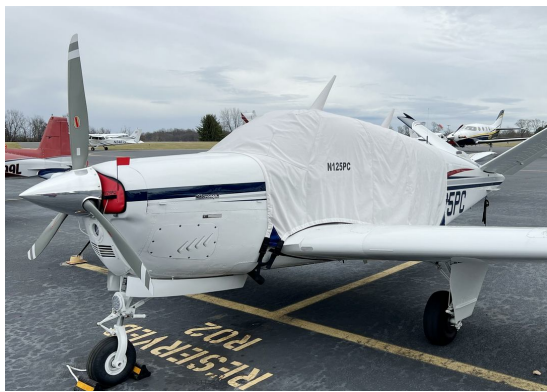
Beech V35B Extended Canopy Cover, Engine Plugs