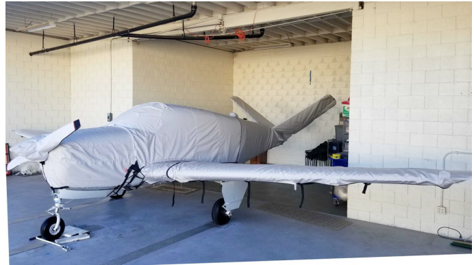
Beech Bonanza N35 Complete Cover Set