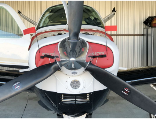
Beech Bonanza Engine Inlet Plugs

Engine Inlet Plugs are custom fit for your Beech Bonanza/Debonair intakes, made with heavy-duty vinyl material, and stuffed with a single block of sculpted urethane foam. Each plug has a zipper that allows the foam to be removed and dried if necessary. Engine plugs have warning flags that are visible from the cockpit or 'remove before flight' streamers sewn onto the face of the plugs. Most plugs are imprinted with the aircraft registration number in black for an extra charge. Storage bag NOT included. Engine plugs may be inserted after flight when the engine is still warm. Engine Inlet Plugs are commonly referred to as Cowl Plugs, Intake Plugs, Cowl Blocks, Engine Blocks, and Engine Bungs. Designed to prevent damage to the aircraft extremities in crowded hangars, these products are made of bright red Naugahyde and thickly padded with a sandwich of closed cell foam. Nowadays they are also made using bright red Neoprene padded laminated (think: wetsuit material).