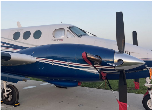
Beech King Air C90 Cockpit HeatShields