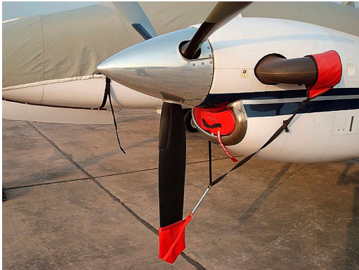
Prop Tie-down/Exhaust Covers

water resistance, UV resistance and anti-static buildup. The inner lining is a very soft and smooth microfiber to prevent scratching. The material is very reflective, and tests show that the cabin interior temperature can be reduced to near-ambient temperature on the hottest of days. It is water, ice and snow repellent, yet breathable to allow moisture to escape from between the cover and the aircraft surface.