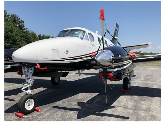
Beech C90A Prop Tie Downs/Exhaust Covers