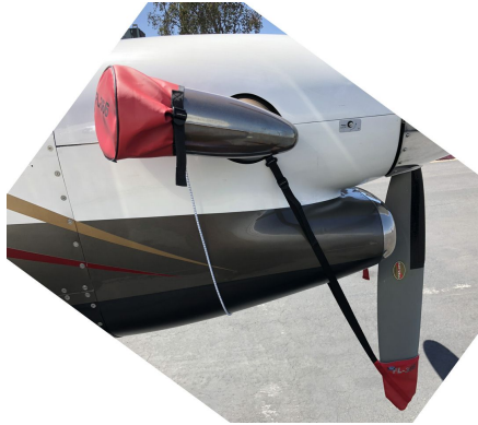
Beech King Air 350 Prop Tie-Downs/Exhaust Covers Combination

water resistance, UV resistance and anti-static buildup. The inner lining is a very soft and smooth microfiber to prevent scratching. The material is very reflective, and tests show that the cabin interior temperature can be reduced to near-ambient temperature on the hottest of days. It is water, ice and snow repellent, yet breathable to allow moisture to escape from between the cover and the aircraft surface.