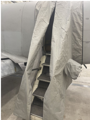
King Air Airstair Door Cover