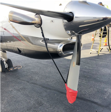
Beech King Air 350 Prop Tie-Downs