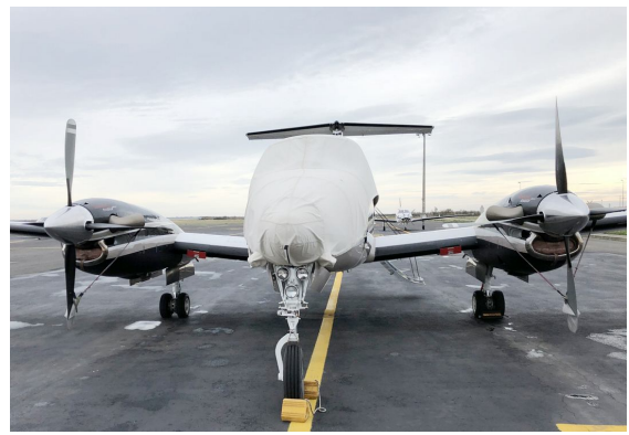
King Air 200 Canopy/Nose Cover