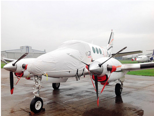
King Air Cockpit/Nose Cover, Plugs, Prop Tie/Exhaust Covers

Engine Inlet Plugs are custom fit for your Beech King Air 300 intakes, made with heavy-duty vinyl material, and stuffed with a single block of sculpted urethane foam. Each plug has a zipper that allows the foam to be removed and dried if necessary. Engine plugs have warning flags that are visible from the cockpit or 'remove before flight' streamers sewn onto the face of the plugs. Most plugs are imprinted with the aircraft registration number in black for an extra charge. Storage bag NOT included. Engine plugs may be inserted after flight when the engine is still warm. Engine Inlet Plugs are commonly referred to as Cowl Plugs, Intake Plugs, Cowl Blocks, Engine Blocks, and Engine Bungs.