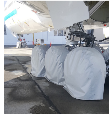
Boeing 777 Main & Nose Gear Tire Covers