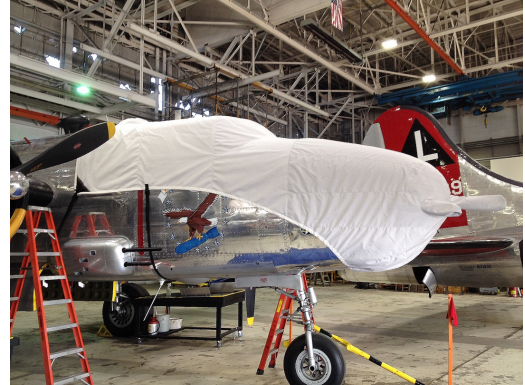
B25 Cockpit/Nose Cover