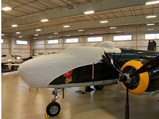
B25 Cockpit/Nose and Gun Turret Covers

This cover type is made from Silver Acrylic Sunbrella canvas and is 100% lined with a soft and smooth microfiber. Bruce's Custom Covers developed this material combination especially for aircraft protection. The outer material is medium weight and treated for water resistance, UV resistance and anti-static buildup. The inner lining is a very soft and smooth microfiber to prevent scratching. The material is very reflective, and tests show that the cabin interior temperature can be reduced to near-ambient temperature on the hottest of days. It is water, ice and snow repellent, yet breathable to allow moisture to escape from between the cover and the aircraft surface.