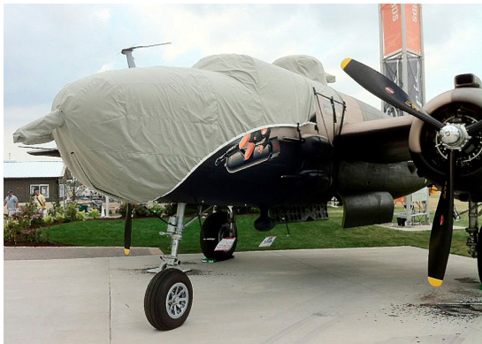
B26 Cockpit/Nose and Gun Turret Covers

This cover type is made from Silver Acrylic Sunbrella canvas and is 100% lined with a soft and smooth microfiber. Bruce's Custom Covers developed this material combination especially for aircraft protection. The outer material is medium weight and treated for water resistance, UV resistance and anti-static buildup. The inner lining is a very soft and smooth microfiber to prevent scratching. The material is very reflective, and tests show that the cabin interior temperature can be reduced to near-ambient temperature on the hottest of days. It is water, ice and snow repellent, yet breathable to allow moisture to escape from between the cover and the aircraft surface.