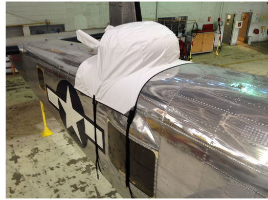
B25 Gun Turret Cover