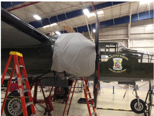
B26 Engine Cover

Engine Covers will cinch around or behind the spinner, cover the entire engine cowl area including the engine air cooling and induction air inlets, and fastens together with Velcro beneath the spinner down the front of the cowling. The Engine Cover is attached with a belly strap aft of the firewall, and can Velcro to the Canopy Cover. Engine Covers are normally made from Solution-Dyed Polyester or Acrylic Sunbrella . An Insulated version of the engine cover can be made with a thicker, quilted, and water-repellent material. The Insulated Engine Cover works well in cold climates to help with engine preheating.