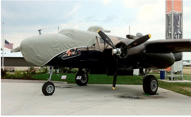
B26 Cockpit/Nose and Gun Turret Covers