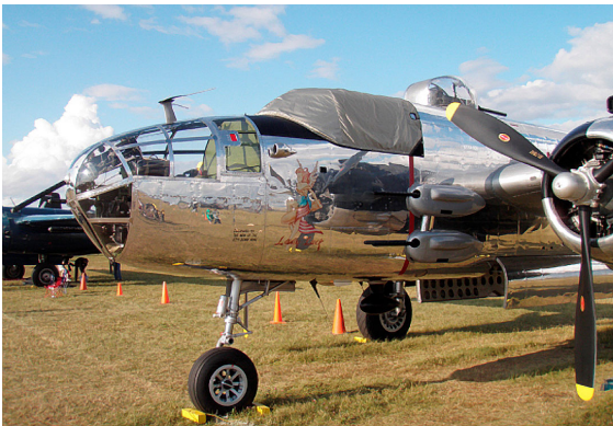
Mitchell B26 Cockpit Cover (Snap-On Type)