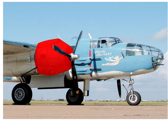
B25 Engine Cover, Illustration