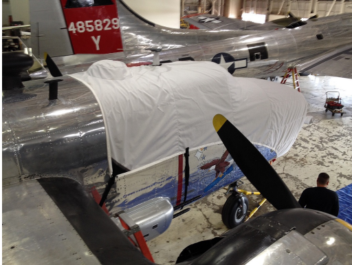
B25 Cockpit/Nose Cover

This cover type is made from Silver Acrylic Sunbrella canvas and is 100% lined with a soft and smooth microfiber. Bruce's Custom Covers developed this material combination especially for aircraft protection. The outer material is medium weight and treated for water resistance, UV resistance and anti-static buildup. The inner lining is a very soft and smooth microfiber to prevent scratching. The material is very reflective, and tests show that the cabin interior temperature can be reduced to near-ambient temperature on the hottest of days. It is water, ice and snow repellent, yet breathable to allow moisture to escape from between the cover and the aircraft surface.