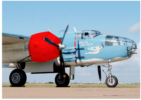
B25 Engine Cover, Illustration