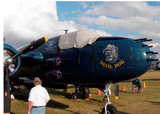
Mitchell B25 Cockpit Cover w/ Custom Imprint (Bellystrap Type)