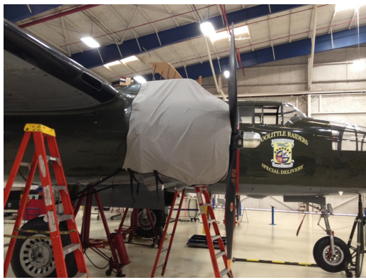
B25 Engine Cover