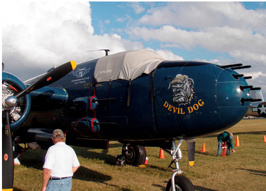
Mitchell B25 Cockpit Cover w/ Custom Imprint (Bellystrap Type)