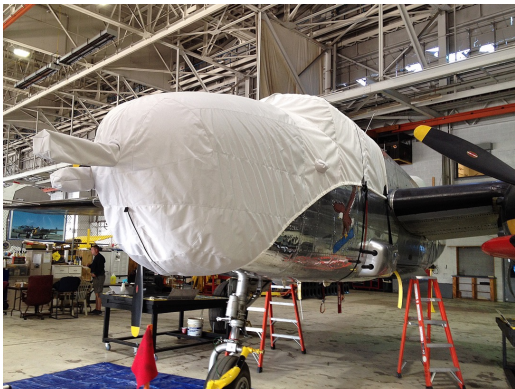
B25 Cockpit/Nose Cover

This cover type is made from Silver Acrylic Sunbrella canvas and is 100% lined with a soft and smooth microfiber. Bruce's Custom Covers developed this material combination especially for aircraft protection. The outer material is medium weight and treated for water resistance, UV resistance and anti-static buildup. The inner lining is a very soft and smooth microfiber to prevent scratching. The material is very reflective, and tests show that the cabin interior temperature can be reduced to near-ambient temperature on the hottest of days. It is water, ice and snow repellent, yet breathable to allow moisture to escape from between the cover and the aircraft surface.