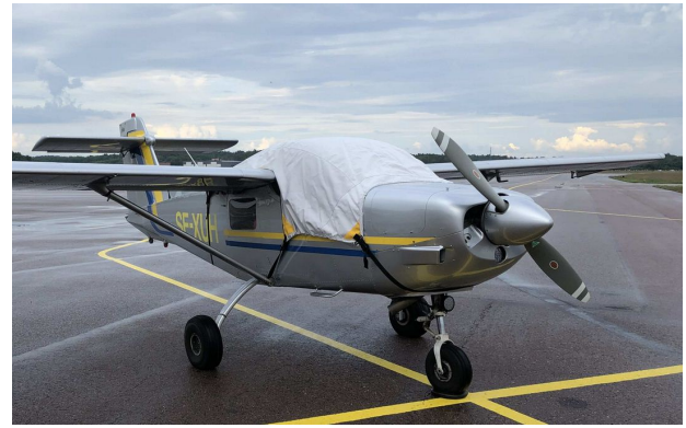
Saab Safari Canopy Cover