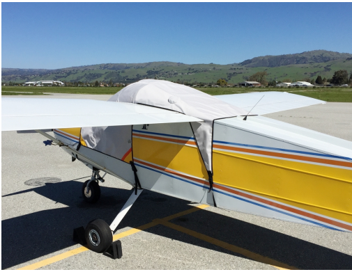
Bolkow Junior 208 Canopy Cover