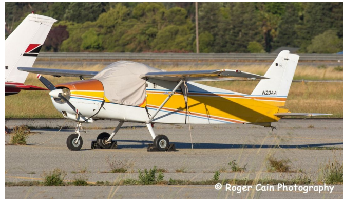
Bolkow Junior 208 Canopy Cover