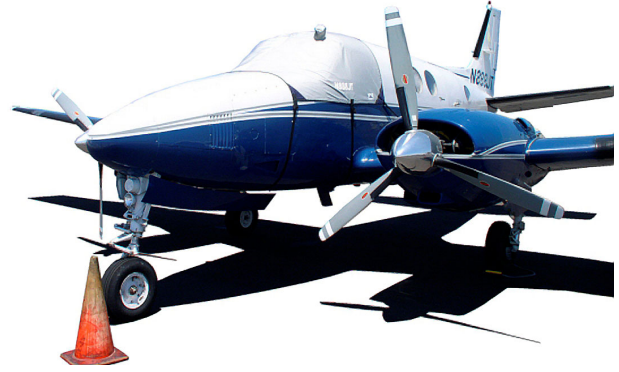
Beech King Air Windshield Cover