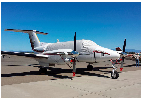
King Air 300 Canopy Cover, Engine Plugs, Prop Tie/Exhaust Covers

Travel Covers are made with Silver Solution-Dyed Polyester fabric and only lined over the windshield to save weight. The material is lightweight and more compact for easy stowage in the aircraft. The polyester material is water resistant, but only intended for occasional use outside. We also have an ultra lightweight material available for fitted hangar dust covers. For daily outdoor use, the non-travel Sunbrella Cover is the best choice.