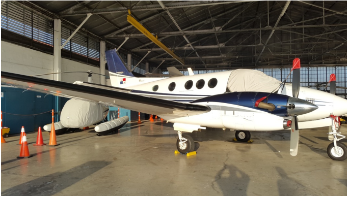
Raytheon Beech King Air Cockpit Cover, Prop Tie/Exhaust Covers, Inlet Plugs

This cover type is made from Silver Acrylic Sunbrella canvas and is 100% lined with a soft and smooth microfiber. Bruce's Custom Covers developed this material combination especially for aircraft protection. The outer material is medium weight and treated for water resistance, UV resistance and anti-static buildup. The inner lining is a very soft and smooth microfiber to prevent scratching. The material is very reflective, and tests show that the cabin interior temperature can be reduced to near-ambient temperature on the hottest of days. It is water, ice and snow repellent, yet breathable to allow moisture to escape from between the cover and the aircraft surface.