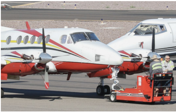
Inlet Plugs and Prop-Tie/Exhaust Covers

Engine Inlet Plugs are custom fit for your Beech King Air 200, 250, 260 (C-12, RC-12, UC-12) intakes, made with heavy-duty vinyl material, and stuffed with a single block of sculpted urethane foam. Each plug has a zipper that allows the foam to be removed and dried if necessary. Engine plugs have warning flags that are visible from the cockpit or 'remove before flight' streamers sewn onto the face of the plugs. Most plugs are imprinted with the aircraft registration number in black for an extra charge. Storage bag NOT included. Engine plugs may be inserted after flight when the engine is still warm. Engine Inlet Plugs are commonly referred to as Cowl Plugs, Intake Plugs, Cowl Blocks, Engine Blocks, and Engine Bung.