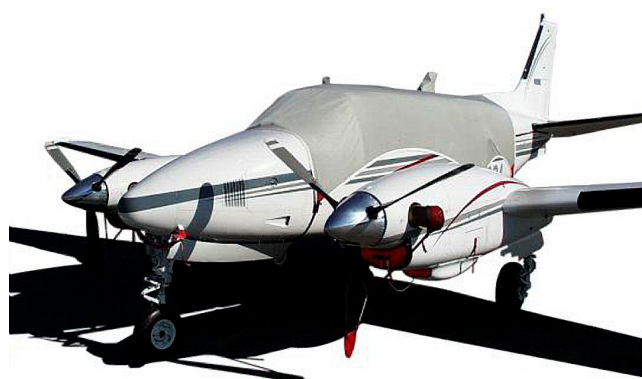
King Air Canopy Cover, Engine Plugs, Prop-Tie/Exhaust Covers