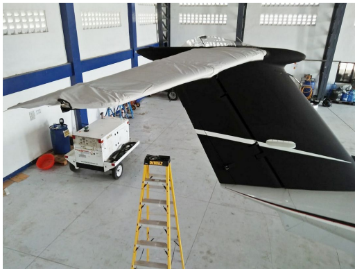
Beech King Air B350 Horizontal Stabilizer Covers

WINTER USE MATERIAL - Made with Solution-Dyed Polyester fabric, this option is intended for seasonal use to aid in deicing, rain mitigation, or for occasional travel. The material is lighter and more compact, but more susceptible to UV damage and may have a shorter useful life if used continuously outside than the all-year use material.