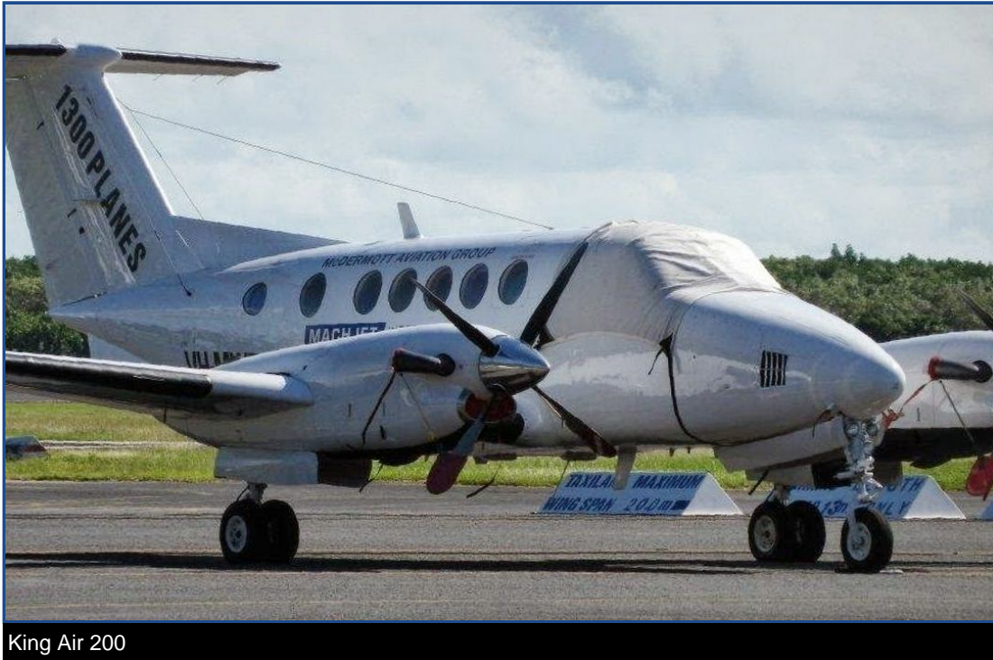
King Air 200