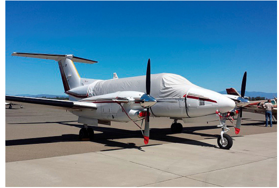
King Air 300 Canopy Cover, Engine Plugs, Prop Tie/Exhaust Covers