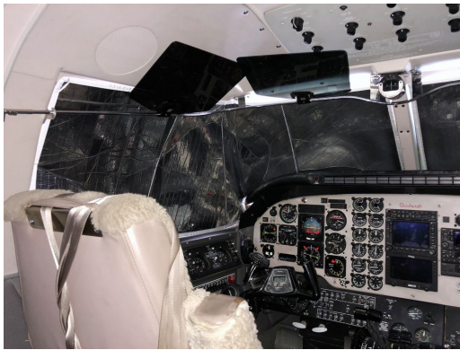
Beech King Air 90 & 100 (U-21, RU-21, T-44) Cockpit Heatshields

Cockpit Heatshields are interior sunshades for the aircraft's cockpit. The product is a unique composite of closed-cell foam with a silver mylar finish. The semi-rigid design is stiff enough to stand inside the window framing. The set folds up flat and is easily stored in the included storage sleeve. Some designs may require velcro and suction cups. A Heatshield is an excellent short-term remedy for cockpit overheating, but an external fabric cover is more effective for long-term protection.