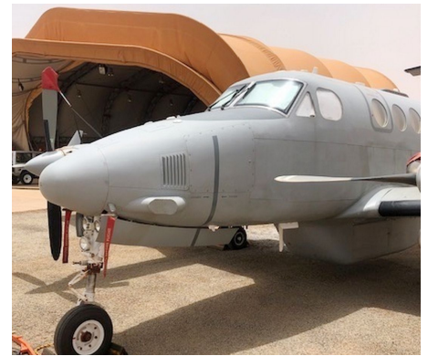
Beech King Air Cockpit HeatShields