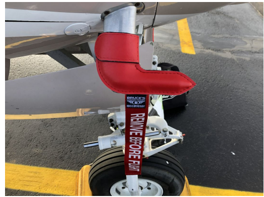
Raytheon King Air B200GT Pitot Tube Cover.