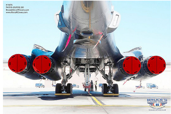
B1-B Exhaust Plugs