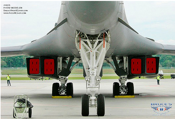
B1-B Bomber Intake Plugs

The Engine Inlet Plugs are custom fit for your Rockwell B-1B Lancer intakes, made with heavy-duty vinyl material, and stuffed with a single block of sculpted urethane foam. Each plug has a zipper that allows the foam to be removed and dried if necessary. Engine plugs have 'remove before flight' streamers sewn onto the face of the plugs. Most plugs are imprinted with the aircraft registration number in black for an extra charge. Storage bag NOT included. Engine plugs may be inserted after flight when the engine is still warm. Engine Inlet Plugs are commonly referred to as Cowl Plugs, Intake Plugs, Cowl Blocks, Engine Blocks, and Engine Bungs.