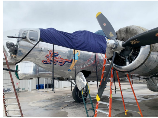
Boeing B-17 Canopy Cover