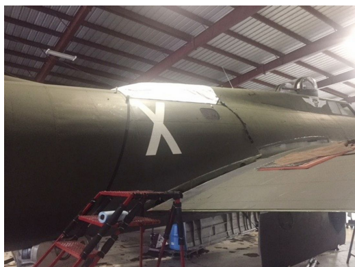
Hatch Cover on a classic B17.