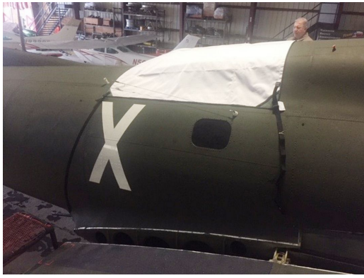
Hatch Cover on a classic B17.