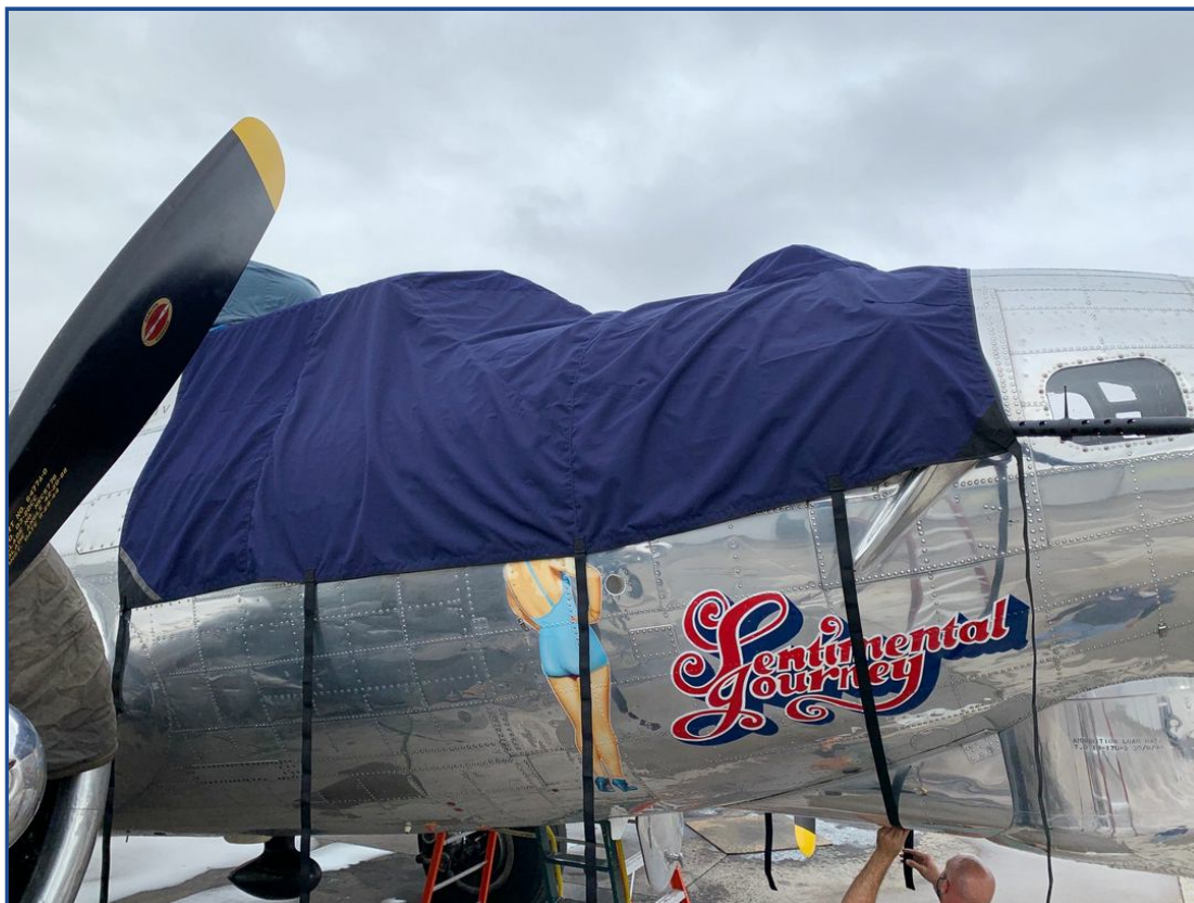
Boeing B-17 Canopy Cover