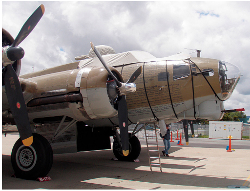
B-17 Canopy/Gun Turret Cover

the hottest of days. It is water, ice and snow repellent, yet breathable to allow moisture to escape from between the cover and the aircraft surface.