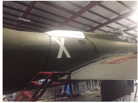
Hatch Cover on a classic B17.