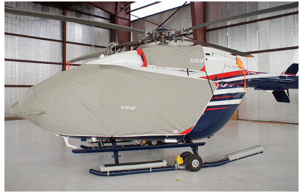
Bubble Cover w/ nose mounted radome, Upper Deck Plugs/Cover