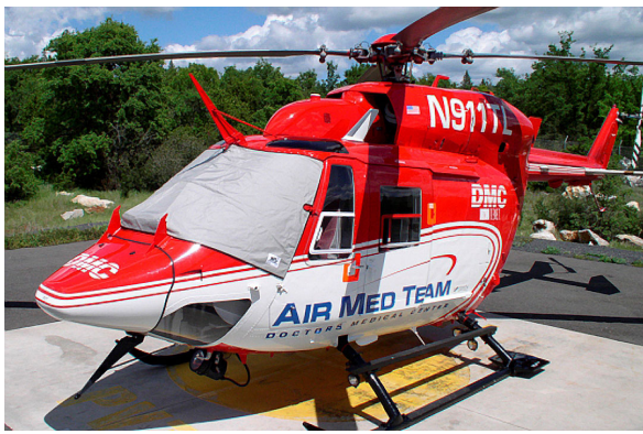
BK-117 Windshield Cover