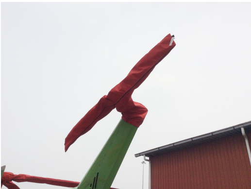
MBB BO-105 Tail Rotor Covers