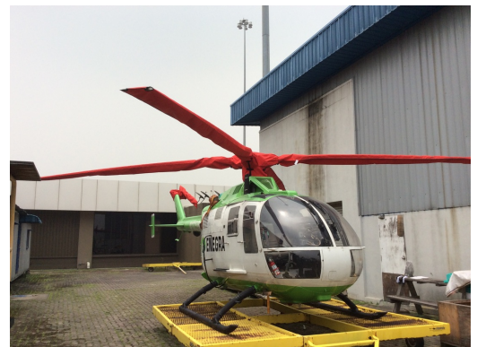
MBB BO-105 Blade, Rotor Head & Tail Rotor Covers