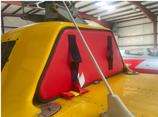
BO 105CB Intake Plug