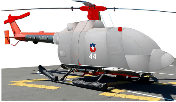
MBB BO-105 Full Body, Rotor Mast & Tail Rotor Covers (illustration)

This cover type is made from Silver Acrylic Sunbrella canvas and is 100% lined with a soft and smooth microfiber. Bruce's Custom Covers developed this material combination especially for aircraft protection. The outer material is medium weight and treated for water resistance, UV resistance and anti-static buildup. The inner lining is a very soft and smooth microfiber to prevent scratching. The material is very reflective, and tests show that the cabin interior temperature can be reduced to near-ambient temperature on the hottest of days. It is water, ice and snow repellent, yet breathable to allow moisture to escape from between the cover and the aircraft surface.