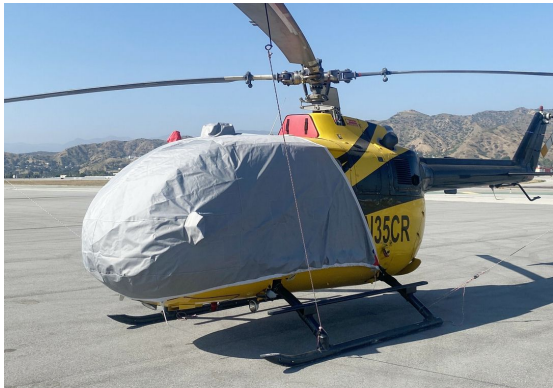
Eurocopter BO-105 Bubble Cover, Standard Model

The Engine Inlet Plugs are custom fit for your Eurocopter BO-105 intakes, made with heavy-duty vinyl material, and stuffed with a single block of sculpted urethane foam. Each plug has a zipper that allows the foam to be removed and dried if necessary. Engine plugs have 'Remove Before Flight' streamers sewn onto the face of the plugs. Most plugs are imprinted with the aircraft registration number in black for an extra charge. Storage bag NOT included. Engine plugs may be inserted after flight when the engine is still warm. Engine Inlet Plugs are commonly referred to as Cowl Plugs, Intake Plugs, Cowl Blocks, Engine Blocks, and Engine Bungs.