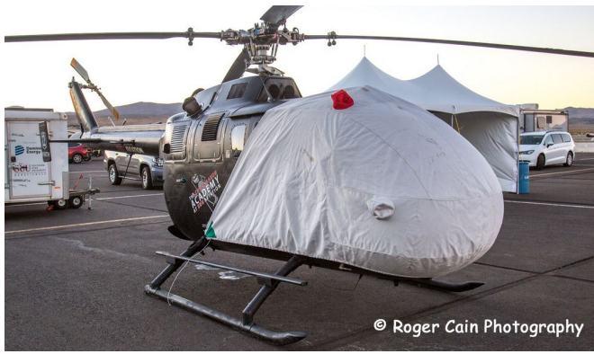
MBB BO-105 Bubble Cover