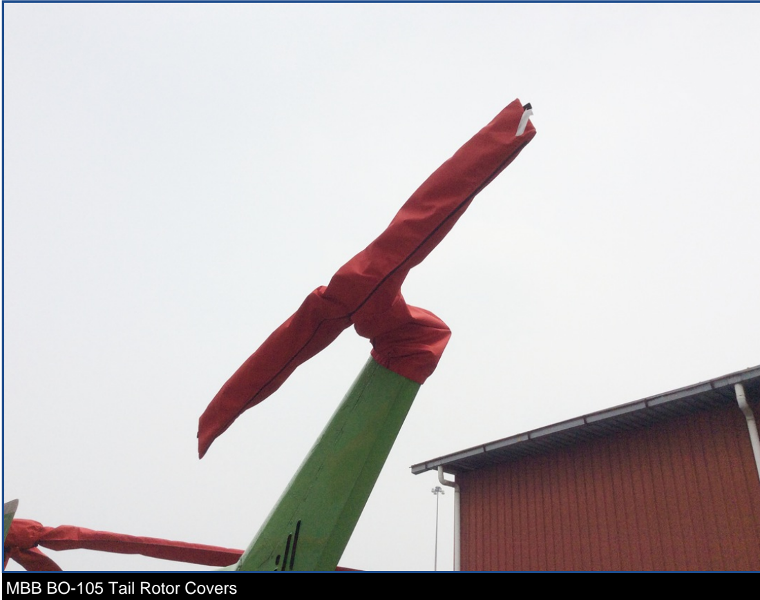
MBB BO-105 Tail Rotor Covers